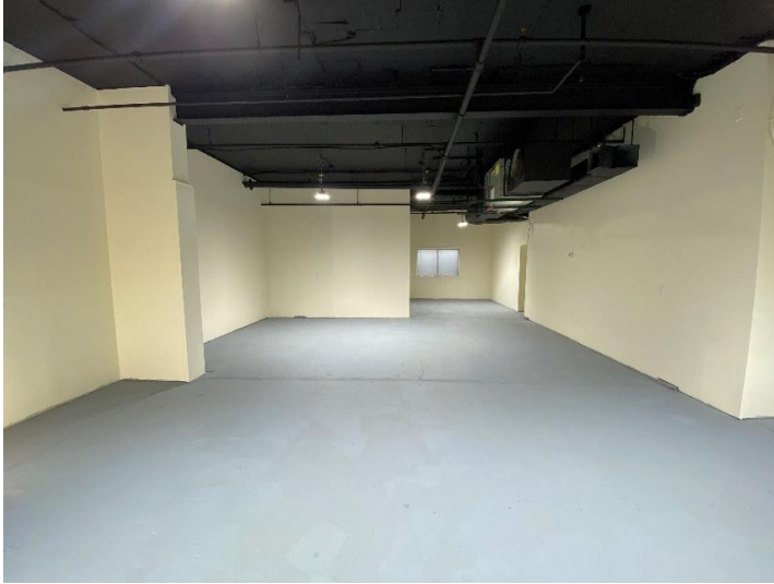
Warehouse Space "1A"