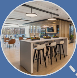
Full-service cafeteria and seating for 160 people