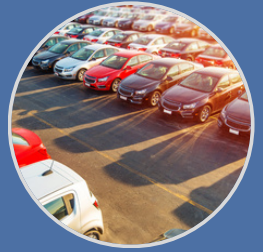
Extensive parking , including covered executive parking