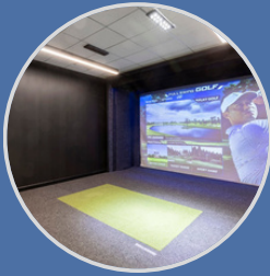
State-of-the-art golf simulator

Ferncroft Corporate Center is a suburban oasis where businesses thrive off urban-style convenience. From the 12.5 acres of beautiful grounds and sweeping views of the suburban landscape, after a $4 million re-investment to the full-service cafeteria, tenant lounge with state-of-the-art golf simulator and fitness center, Ferncroft is truly the best of both worlds.