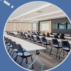
Conference center with configurable seating and established AV amenities