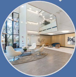
Lobby with high-end finishes