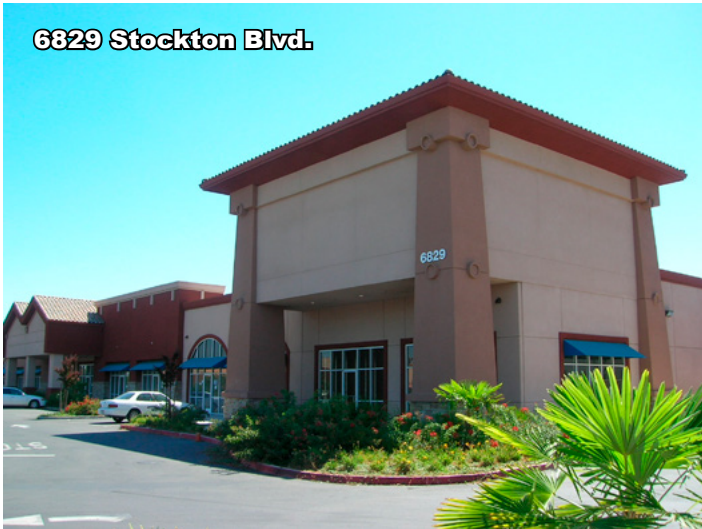
6829 Stockton Blvd.