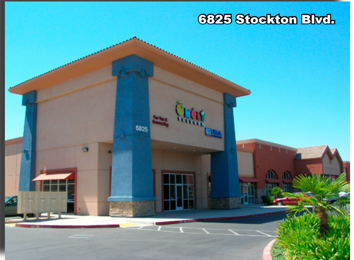
6825 Stockton Blvd.