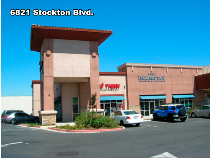
6821 Stockton Blvd.