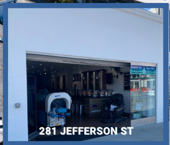
281 JEFFERSON ST