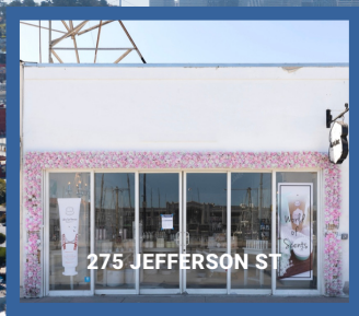
275 JEFFERSON ST