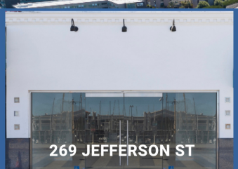
269 JEFFERSON ST