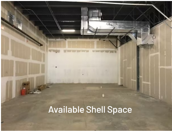
Available Shell Space