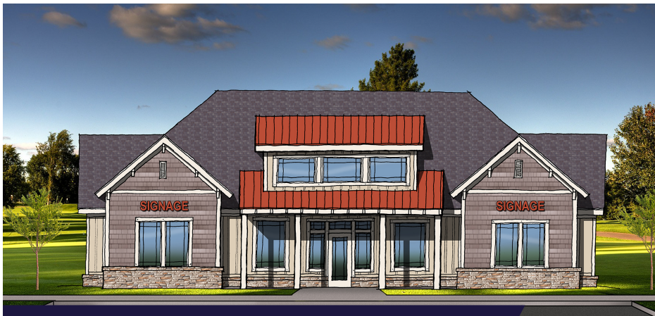
WALTERS STREET ELEVATION