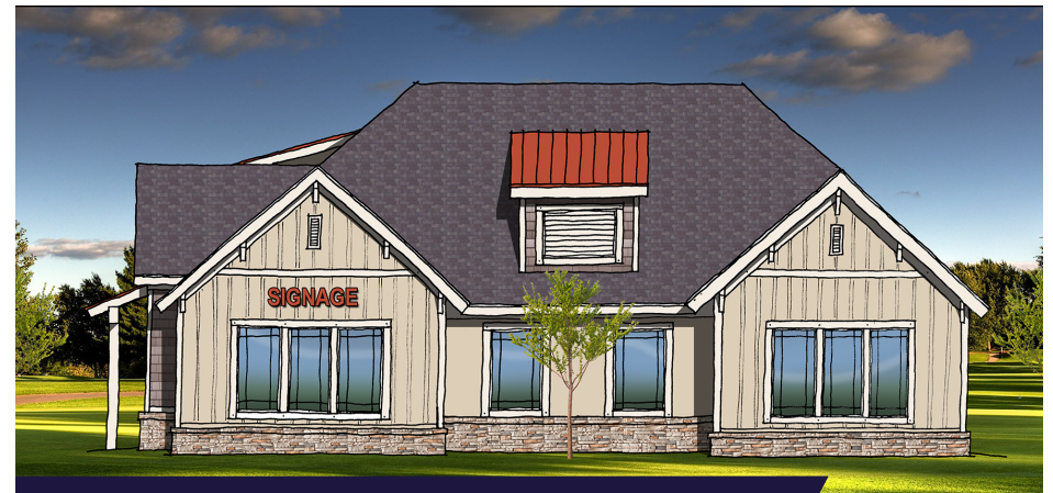
CARROLL STREET ELEVATION