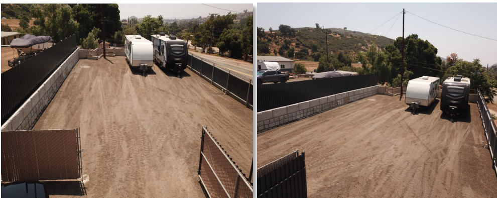
15945 Olde Highway 80