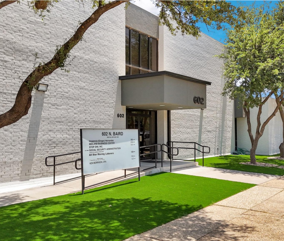
602 N. Baird Street Midland, TX 79701