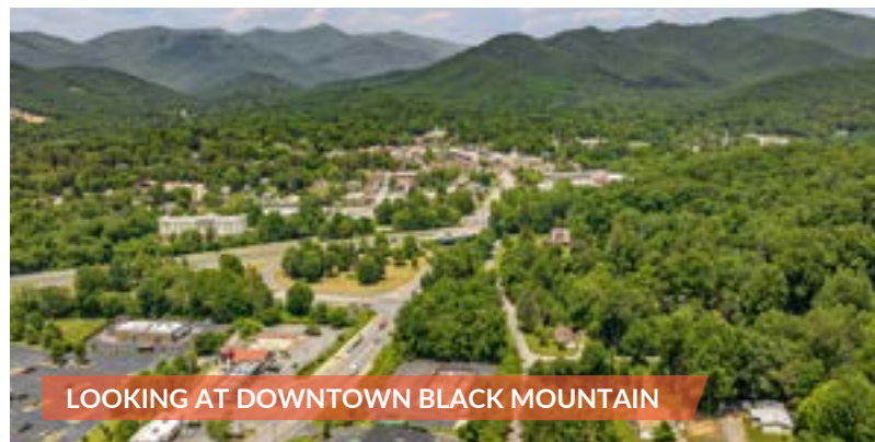
LOOKING AT DOWNTOWN BLACK MOUNTAIN