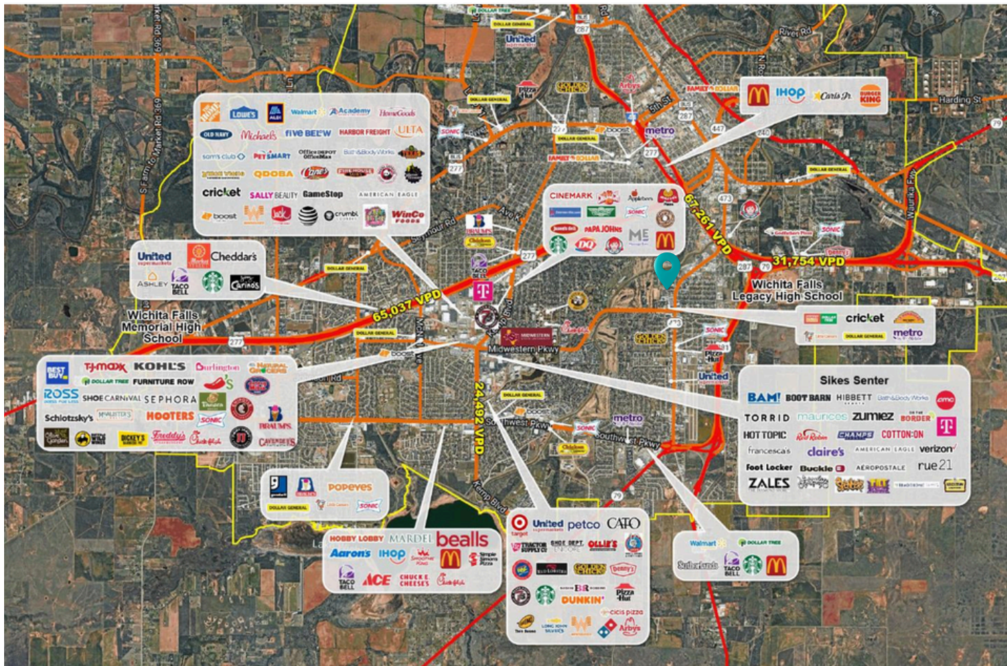
Aerial map used with permission from Lacy Beasley President of Retail Strategies

This versatile office space presents an outstanding investment opportunity. Contact us today for more details or to schedule a viewing.