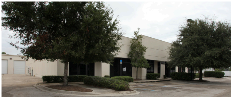
155 St Johns Business Place