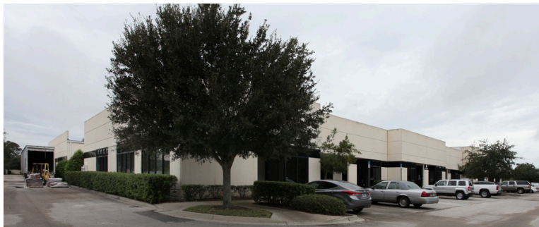
150 St Johns Business Place