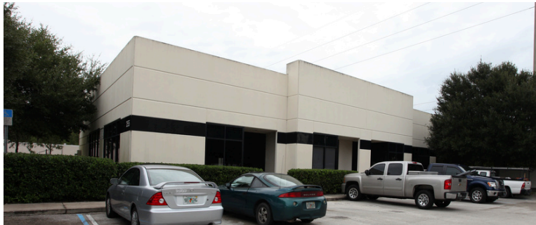
280 Business Park Circle