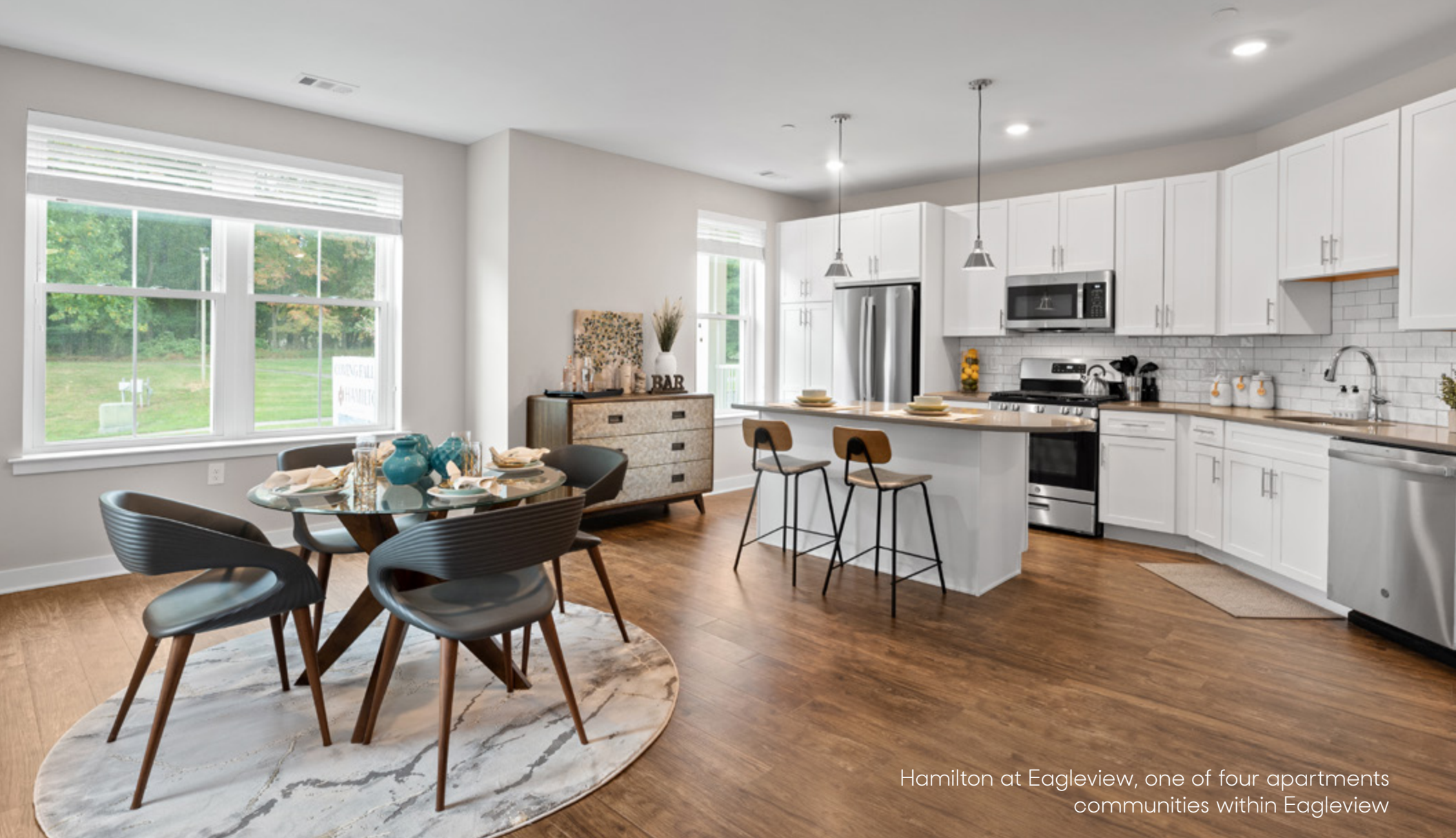
Hamilton at Eagleview, one of four apartments communities within Eagleview

From the Hankin owned, developed, and managed apartment communities within Eagleview, to the single family homes throughout the region, there's no shortage of options for every price point.