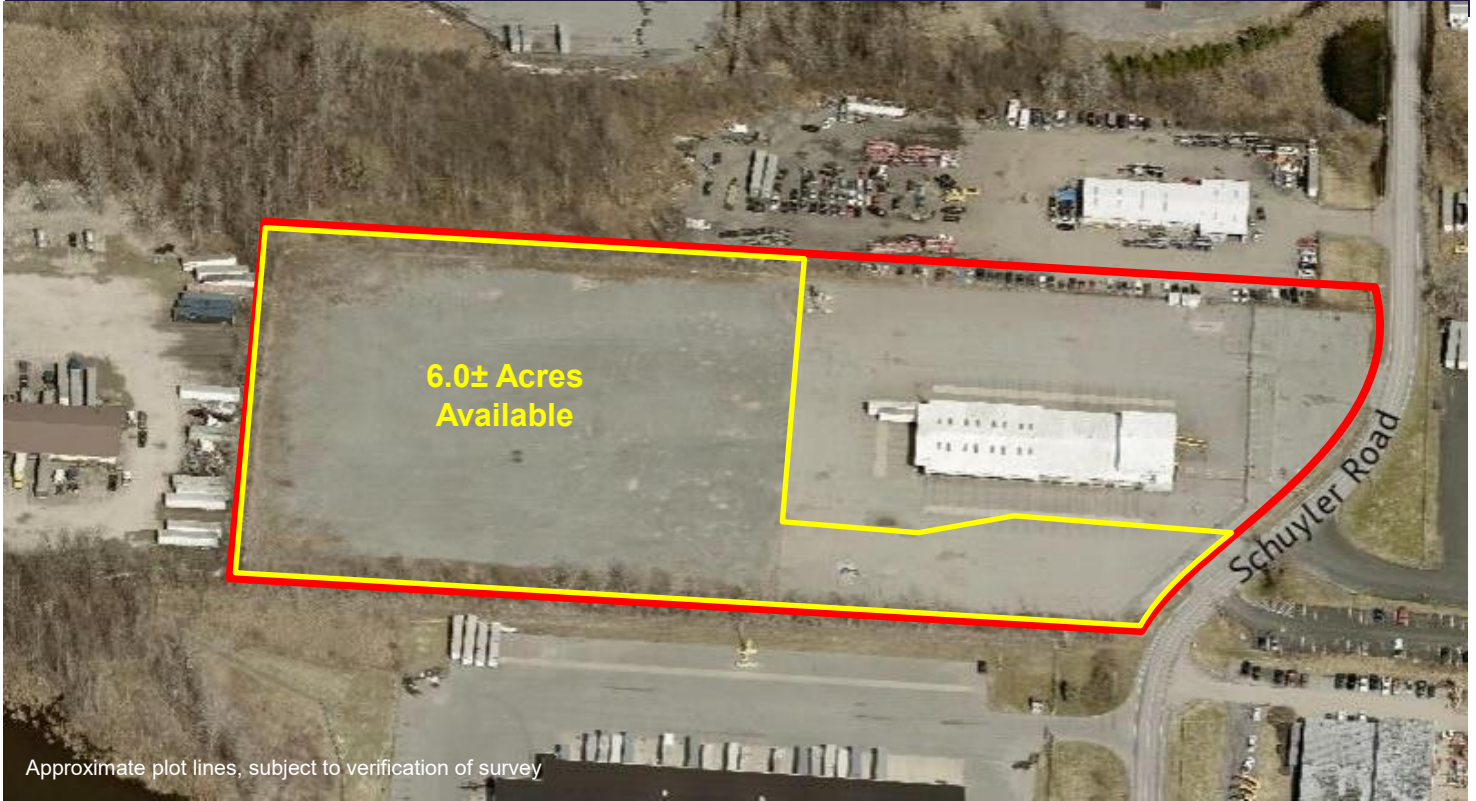
Approximate plot lines, subject to verification of survey