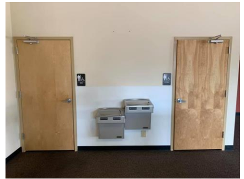
Suite B1-B4 Two Restrooms