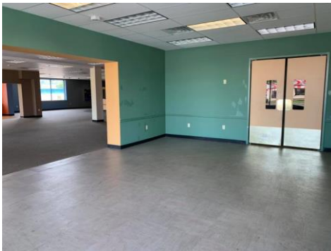
Suite B1-Inside Front and Rear Section with Roll Up Door