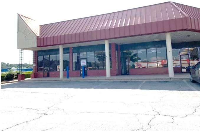
Suite B1-B4 Outside Front View