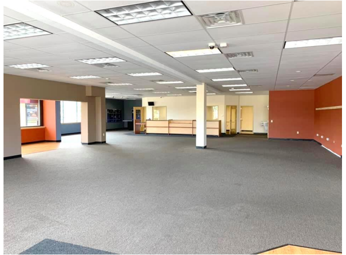
Suite B1-B4 Inside Front to Rear View