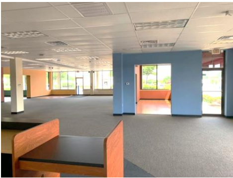
Suite B1-B4 Inside Rear to Front View