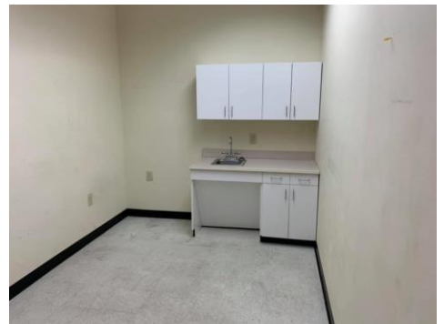
Rear Office with Sink

All information deemed reliable, but not guaranteed