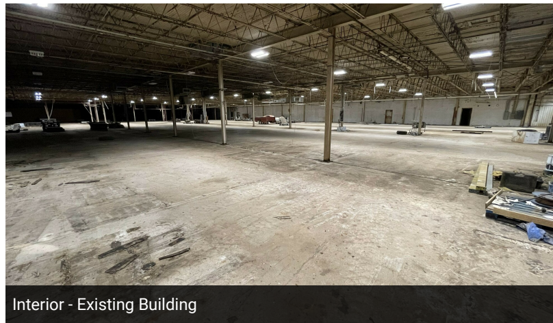
Interior - Existing Building

Information is deemed reliable but is not guaranteed. Agency Disclosure: RPM Group is the agent for the owner of the property described herein.