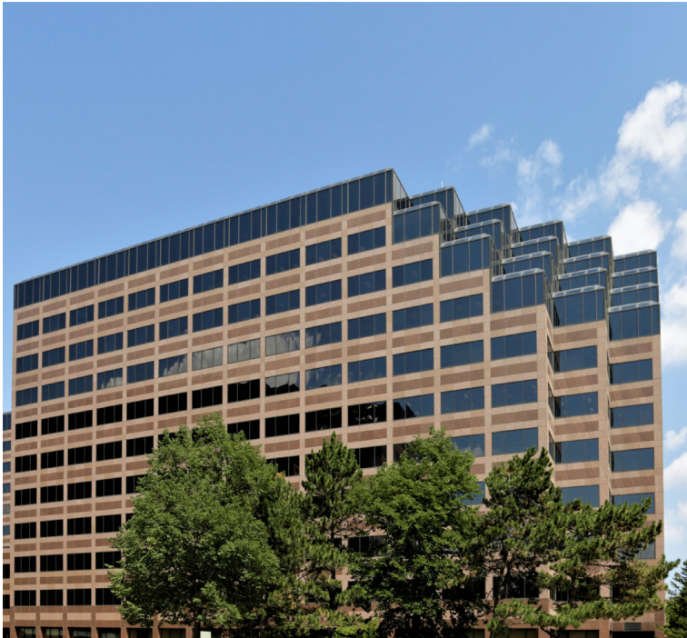
9377 W Higgins Road