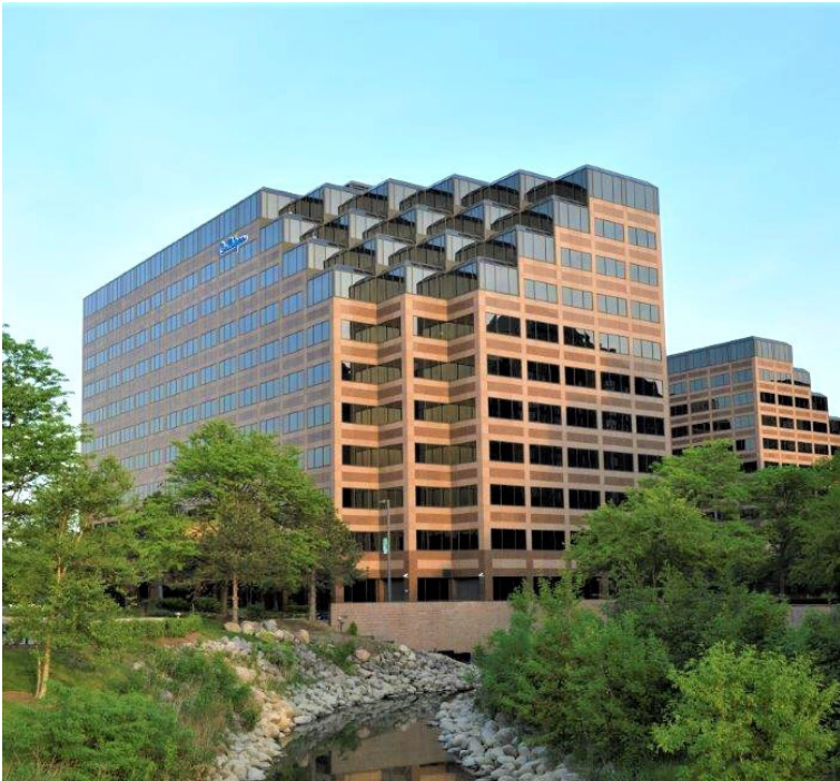
6133 N River Road