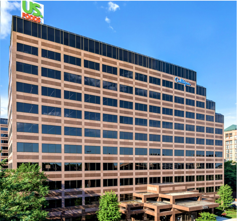
9399 W Higgins Road