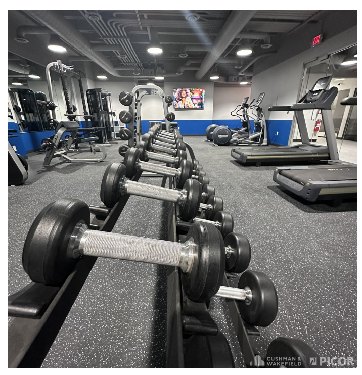
Fitness Center: Renovated in 2024