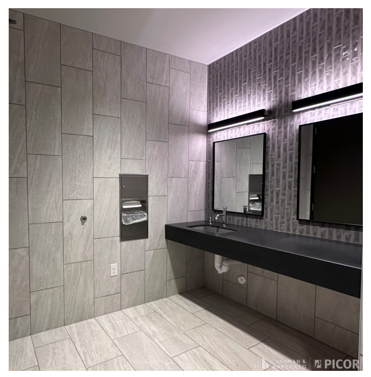
Fitness Center: New Restrooms & Showers