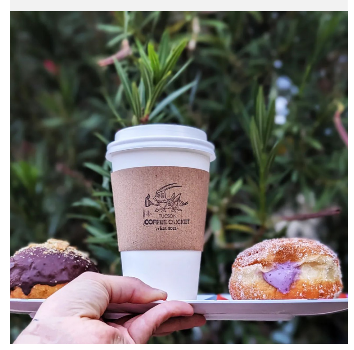
Kiosk: Local Coffee Shop & Baked Goods

Independently Owned and Operated / A Member of the Cushman & Wakefield Alliance Cushman & Wakefield Copyright 2022. No warranty or representation, express or implied, is made to the accuracy or completeness of the information contained herein, and same is submitted subject to errors, omissions, change of price, rental or other conditions, withdrawal without notice, and to any special listing conditions imposed by the property owner(s). As applicable, we make no representation as to the condition of the property (or properties) in question. 2/20/2025