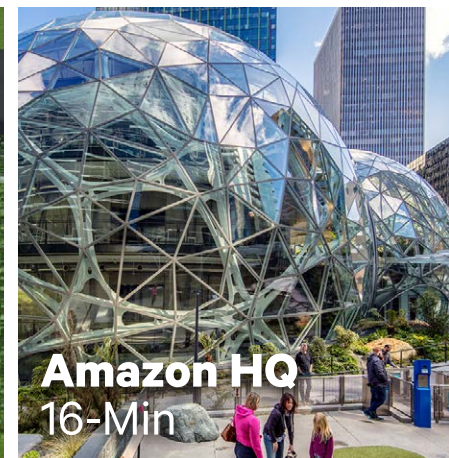
Amazon HQ 16-Min