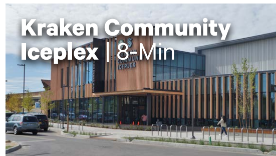
Kraken Community Iceplex | 8-Min