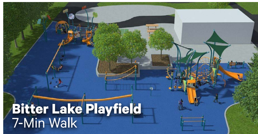
Bitter Lake Playfield 7-Min Walk