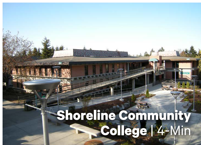
Shoreline Community College | 4-Min