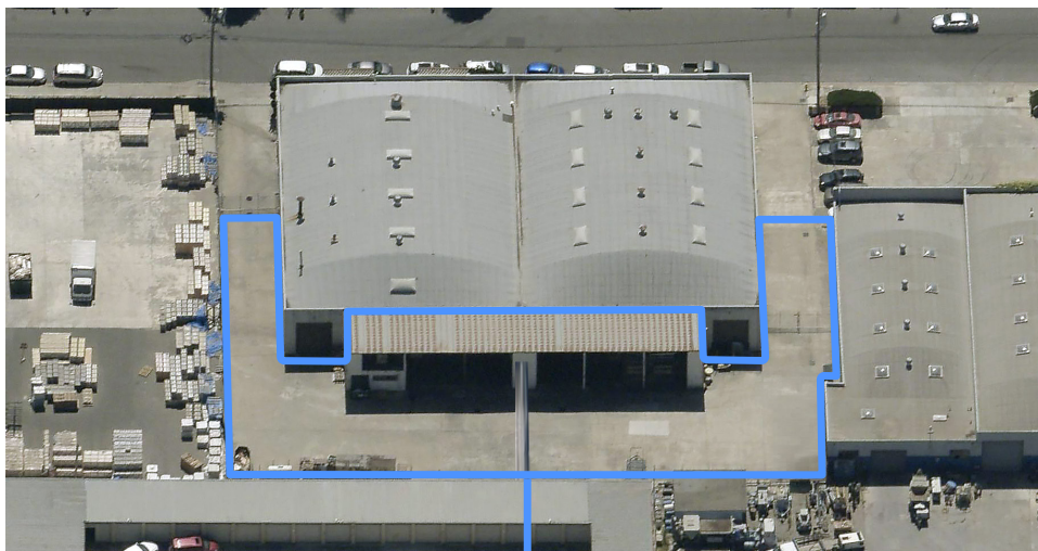
Fenced and secured yard area with a covered canopy