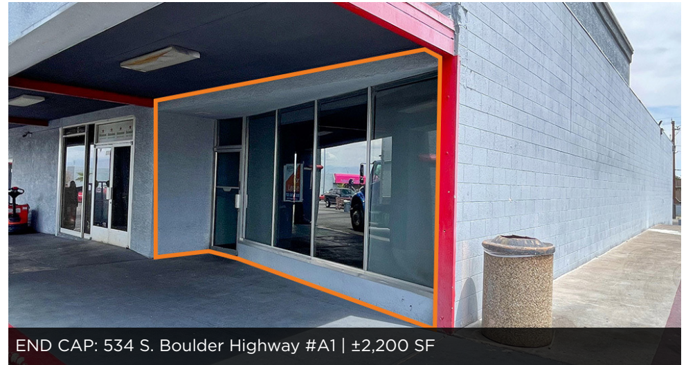
END CAP: 534 S. Boulder Highway #A1 | ±2,200 SF