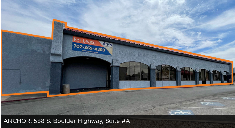
ANCHOR: 538 S. Boulder Highway, Suite #A