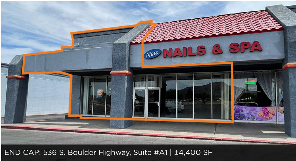
END CAP: 536 S. Boulder Highway, Suite #A1 | ±4,400 SF