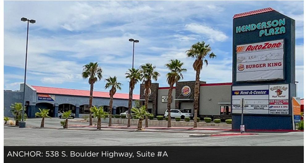
ANCHOR: 538 S. Boulder Highway, Suite #A