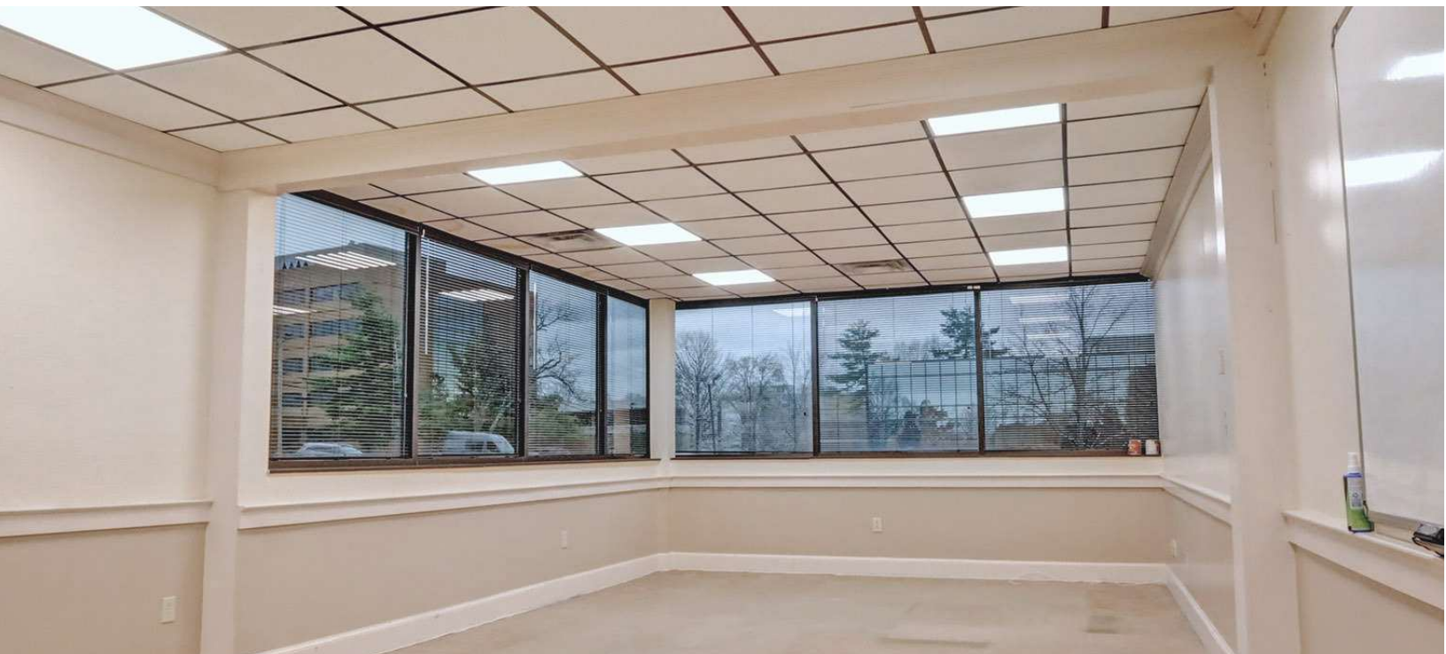
Suite 205 - 580 SF Corner Office Suite

NO WARRANTY OR REPRESENTATION, EXPRESS OR IMPLIED, IS MADE AS TO THE ACCURACY OF THE INFORMATION CONTAINED HEREIN, AND THE SAME IS SUBMITTED SUBJECT TO ERRORS, OMISSIONS, CHANGE OF PRICE, RENTAL OR OTHER CONDITIONS, PRIOR SALE, LEASE OR FINANCING, OR WITHDRAWAL WITHOUT NOTICE, AND OF ANY SPECIAL LISTING CONDITIONS IMPOSED BY OUR PRINCIPALS NO WARRANTIES OR REPRESENTATIONS ARE MADE AS TO THE CONDITION OF THE PROPERTY OR ANY HAZARDS CONTAINED THEREIN ARE ANY TO BE IMPLIED.