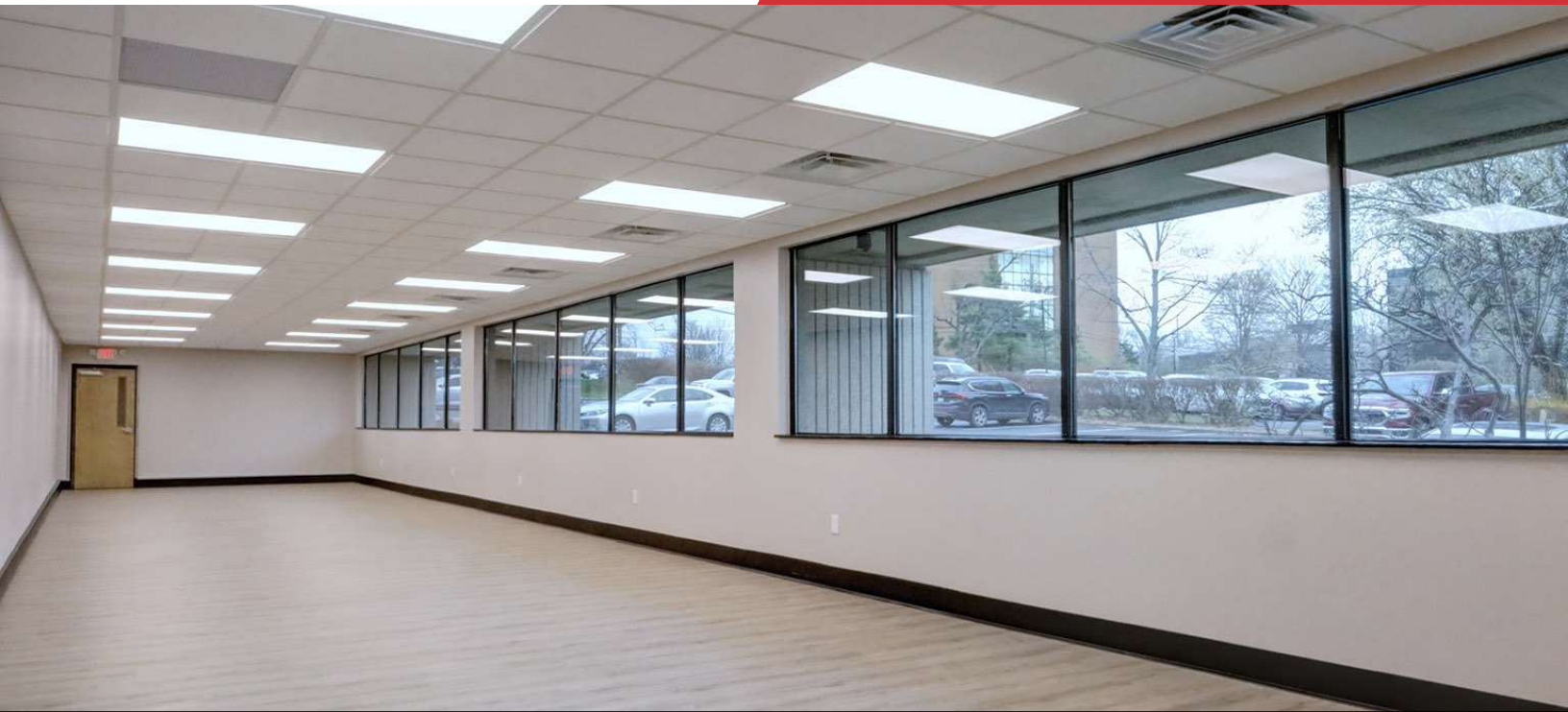
Suite 120 - Existing Layout