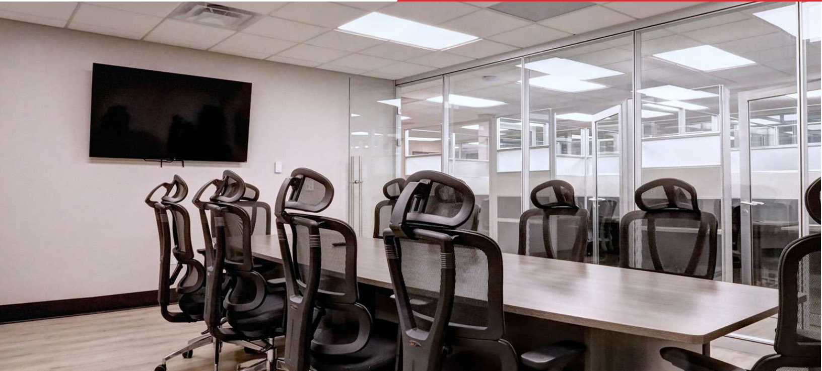
Suite 120 - Potential Fit-Up to Suite Tenant