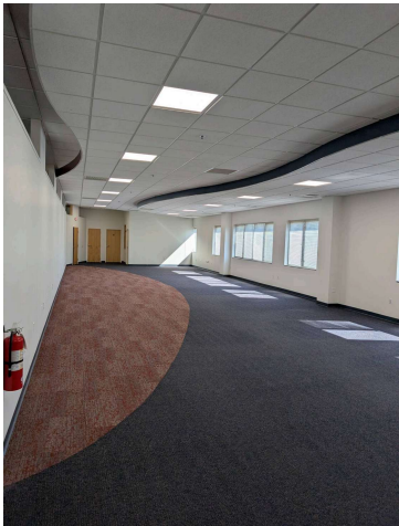
Property Photos (6 photos)

USF 2,040 SF Parking Parking Lot Lease term Negotiable Total Monthly Rent $4,760