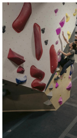
High Point Climbing Gym