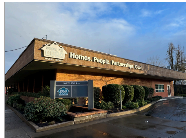
Exterior Building View