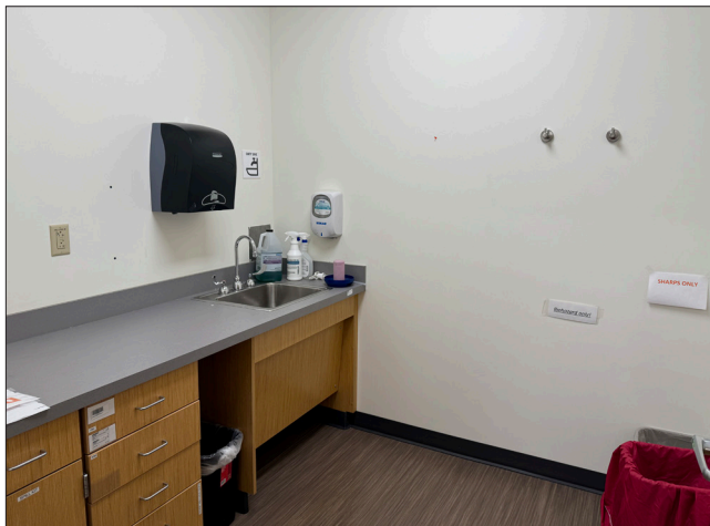
Small Lab Area