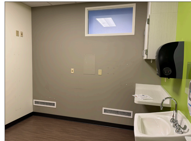
Typical Exam Room