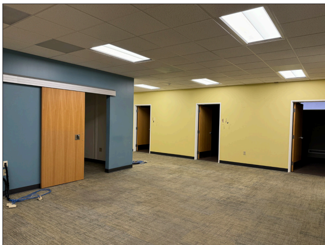
Open area outside of exam rooms