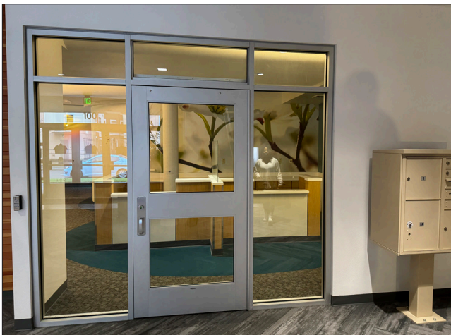
Main Entry from Building Lobby