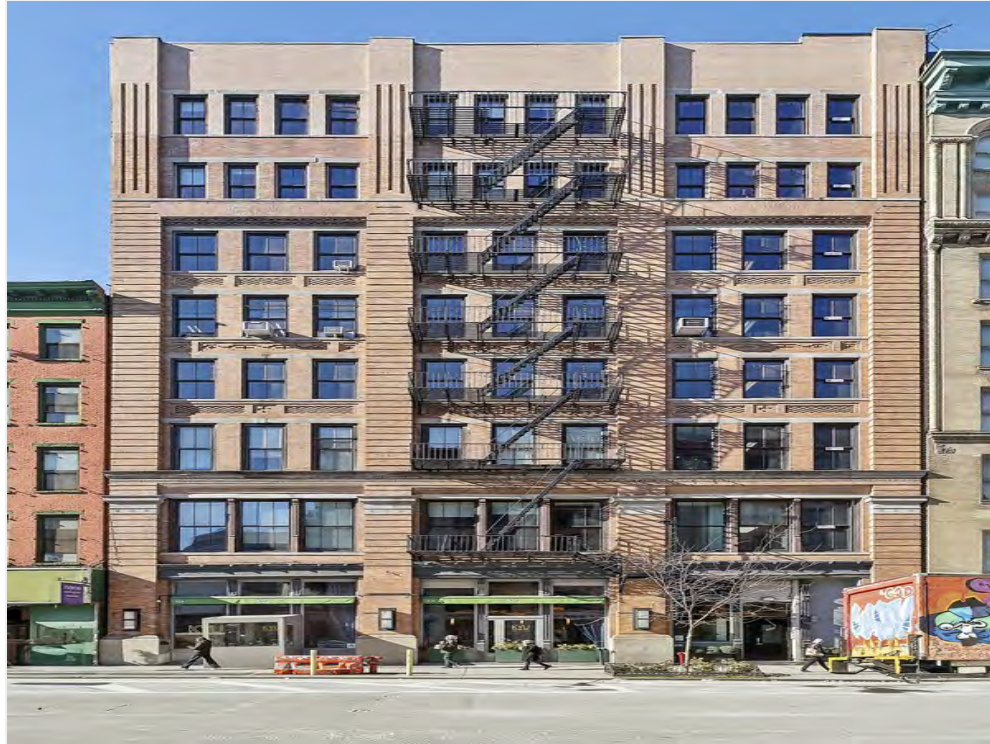
324 Lafayette Exterior