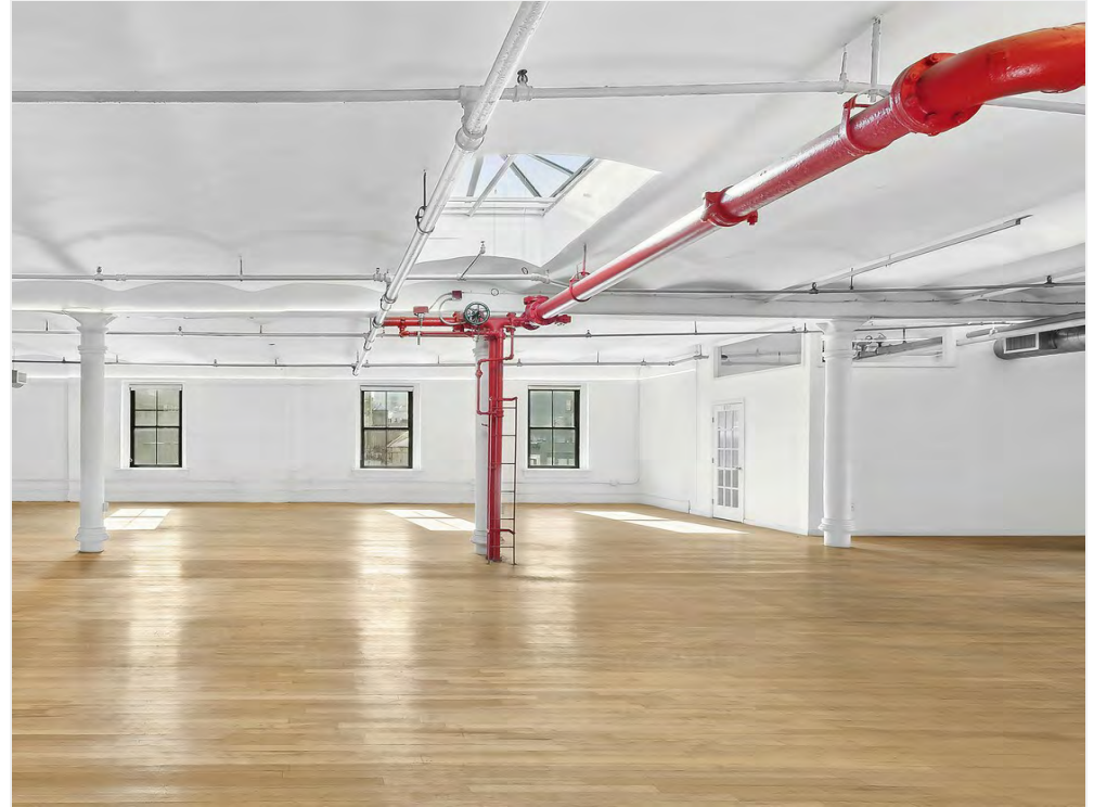
324 South 8th