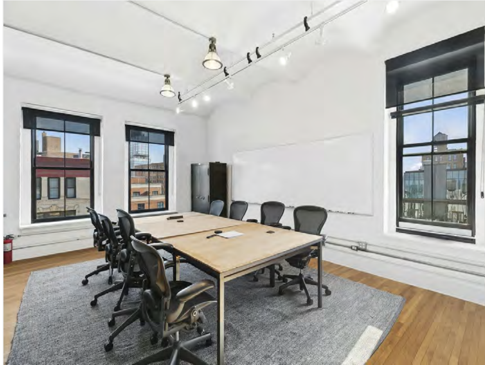
324 SE Potential Corner Conference Room