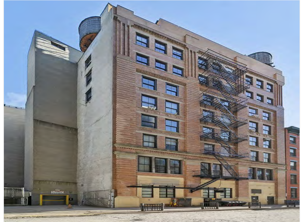
324 Freight Ent - Crosby Exterior