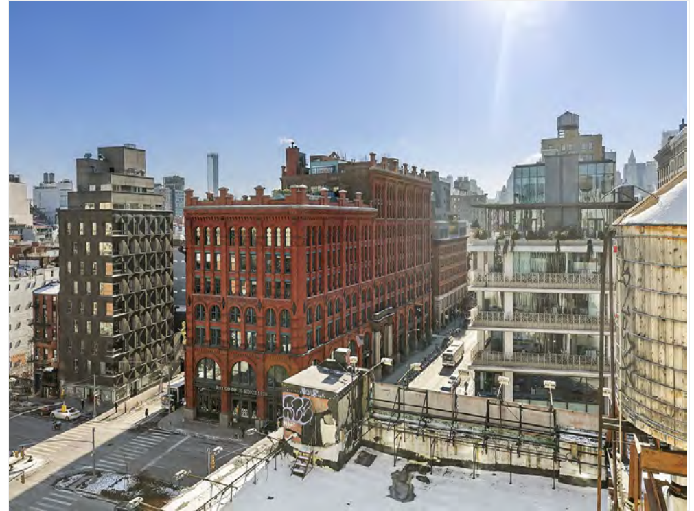
324 Untouched View