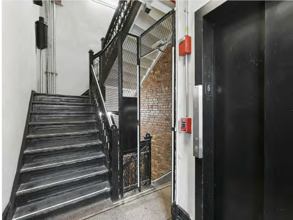
324 8th FI Landing