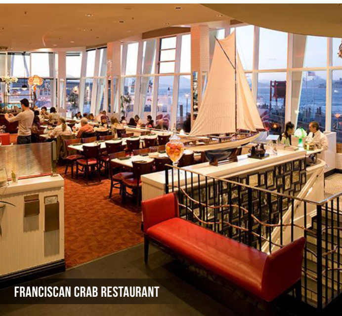
FRANCISCAN CRAB RESTAURANT