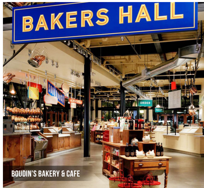
BOUDIN'S BAKERY & CAFE