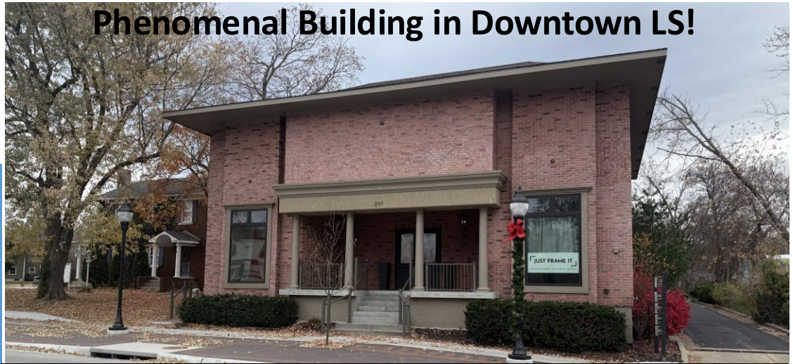
Licata Building – 207 SE 3 rd St. Lee's Summit, MO 64063

The Licata Professional building is highly recognized in downtown Lee's Summit with its beautiful architecture and ease of access. The entry corridor is inviting and welcoming with tenants Just Frame It, Licata's Flowers and a Hair Salon. The owner is willing to split the 1,790 sq. ft. into small retail or offices of 270, 640, 880 sq ft. Tenants will have access to the back parking lot. This is an amazing opportunity to have a retail business or office in award winning downtown Lee's Summit, right across from Green Street Farmers Market and Plaza.