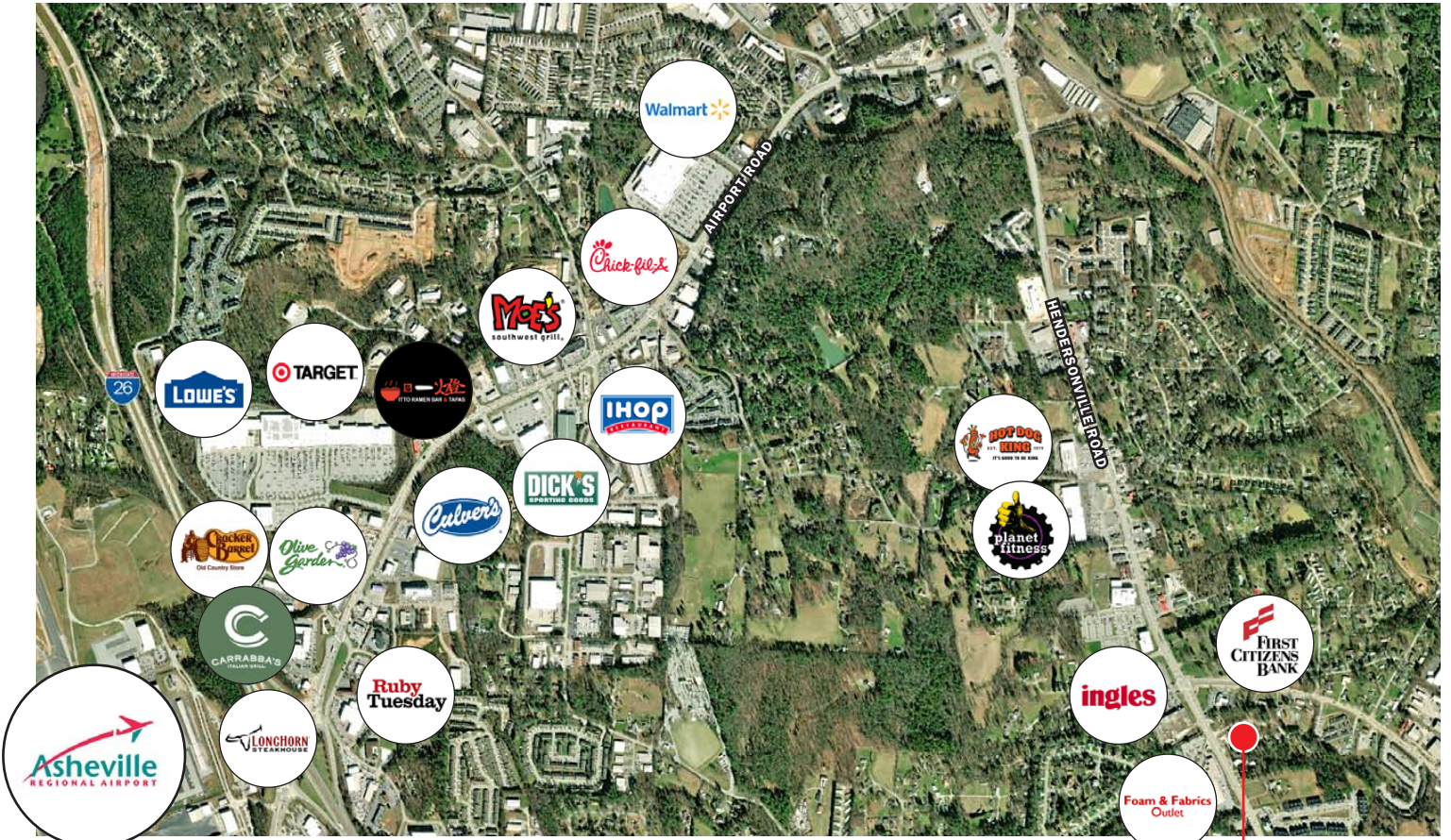
MAP CREDIT: NOAA