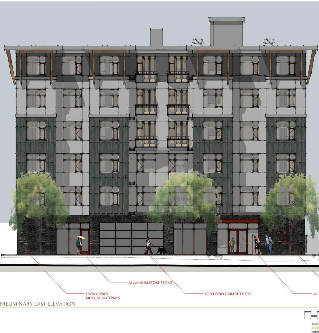
PRELIMINARY EAST ELEVATION