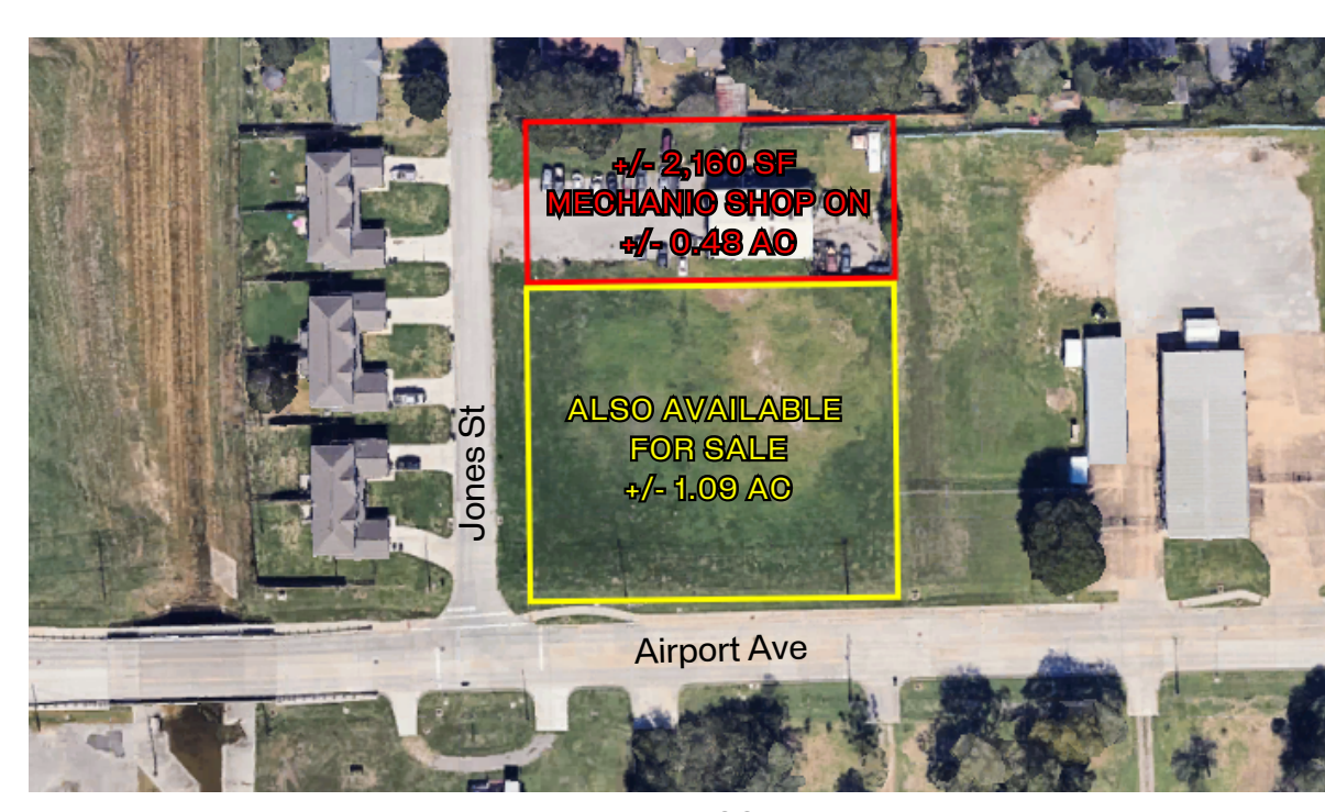
***Property within 100-year floodplain***