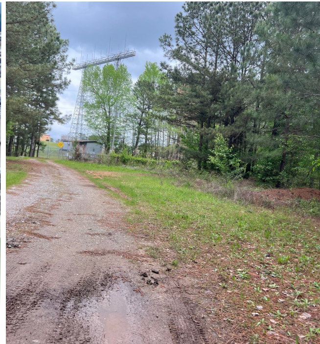
Atlanta Motor Speedway