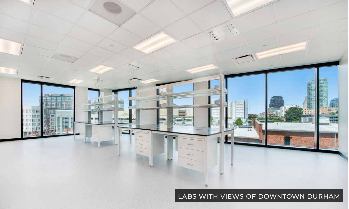
LABS WITH VIEWS OF DOWNTOWN DURHAM