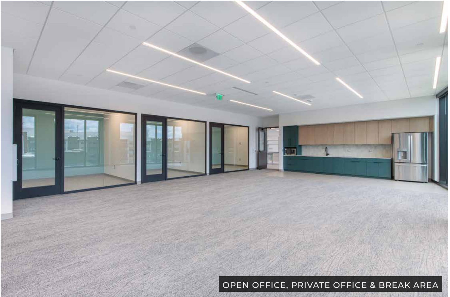
OPEN OFFICE, PRIVATE OFFICE & BREAK AREA