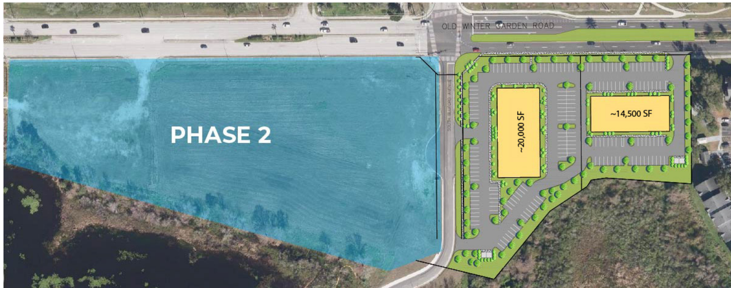
OPTION 1: 2 MEDICAL OFFICE BUILDINGS, TOTALING ~34,500 SF