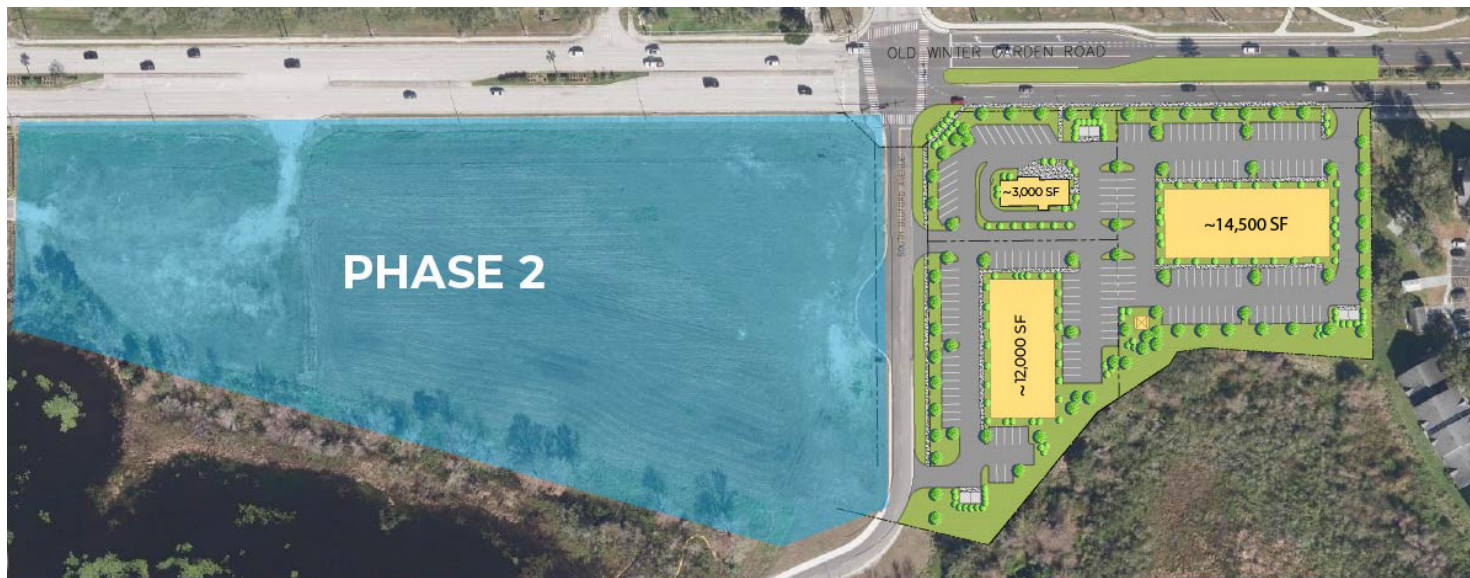
OPTION 2: 2 MEDICAL OFFICE BUILDINGS & 1 RETAIL BUILDING WITH DRIVE THRU, TOTALING ~29,500 SF