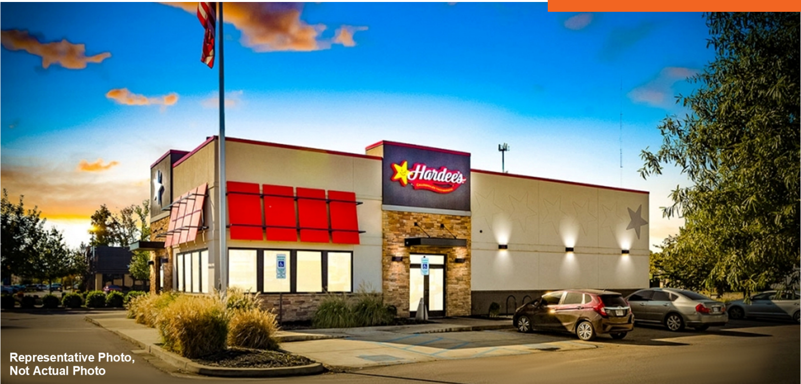
Representative Photo, Not Actual Photo