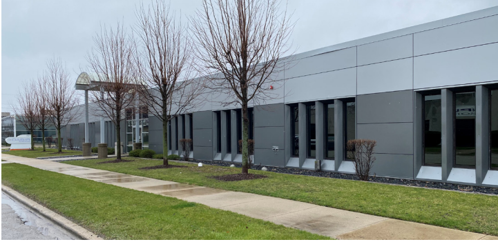
7447 W. WILSON AVE.

7401 & 7447 W. Wilson Ave. Harwood Heights, IL