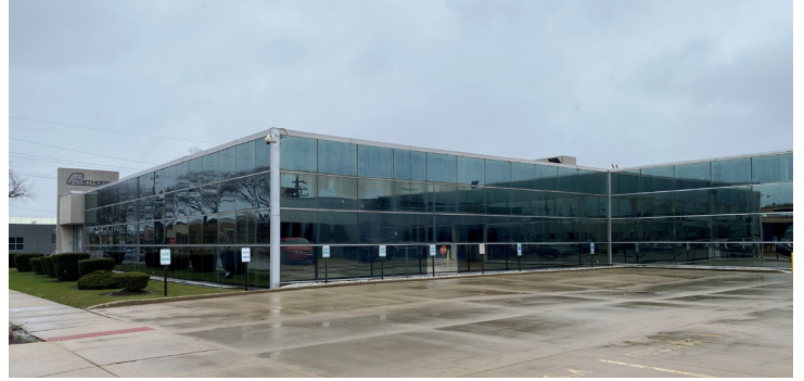
7401 W. WILSON AVE.