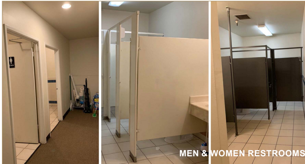
MEN & WOMEN RESTROOMS