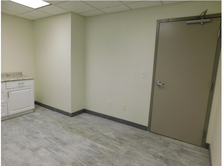
Room 1 - Above Photos—New Flooring, Neutral Paint, Cabinet Counter