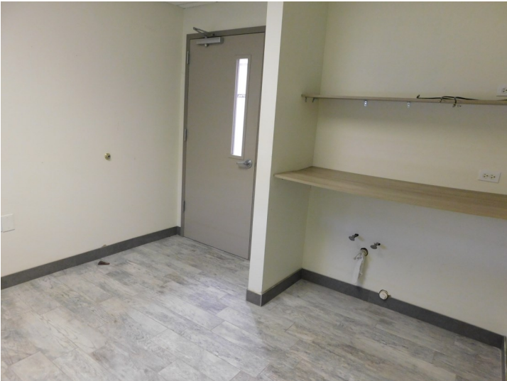
Room 2 - Below Photos—New Flooring, Neutral Paint, Stub Out for Sink