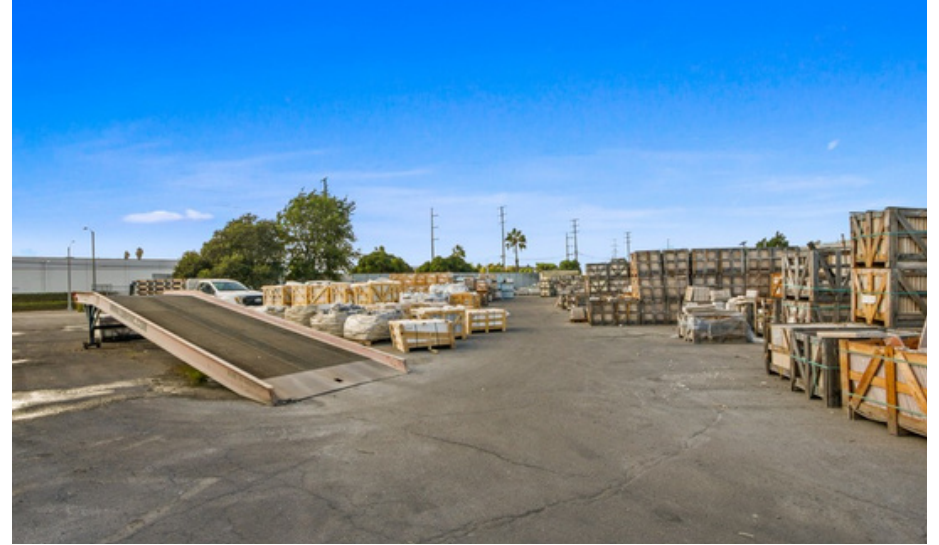
Large Fenced Yard