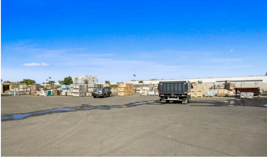
Large Fenced Yard

Ashwill Associates COMMERCIAL REAL ESTATE