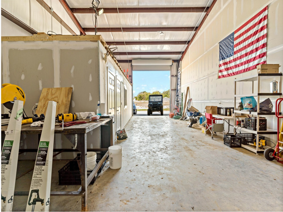
OW warehouse full