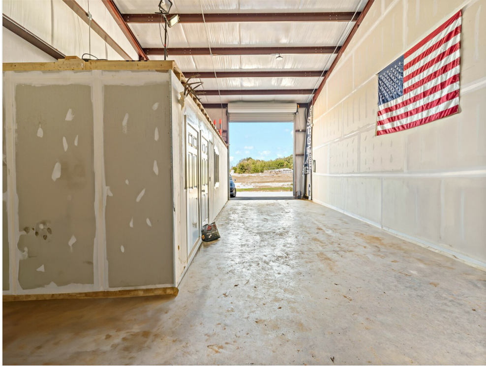
OW Empty warehouse