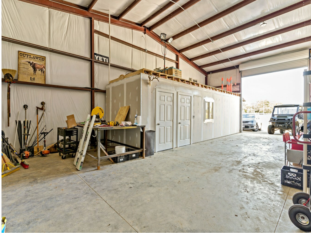
OW warehouse looking at office full