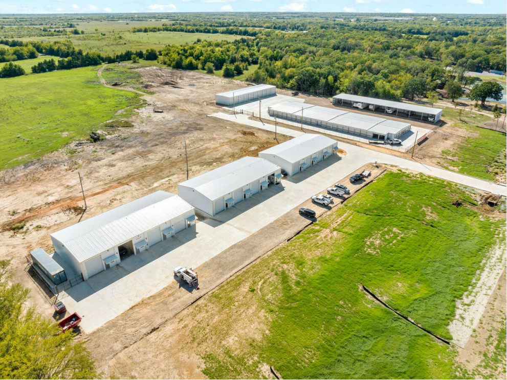
Drone overhead from NE