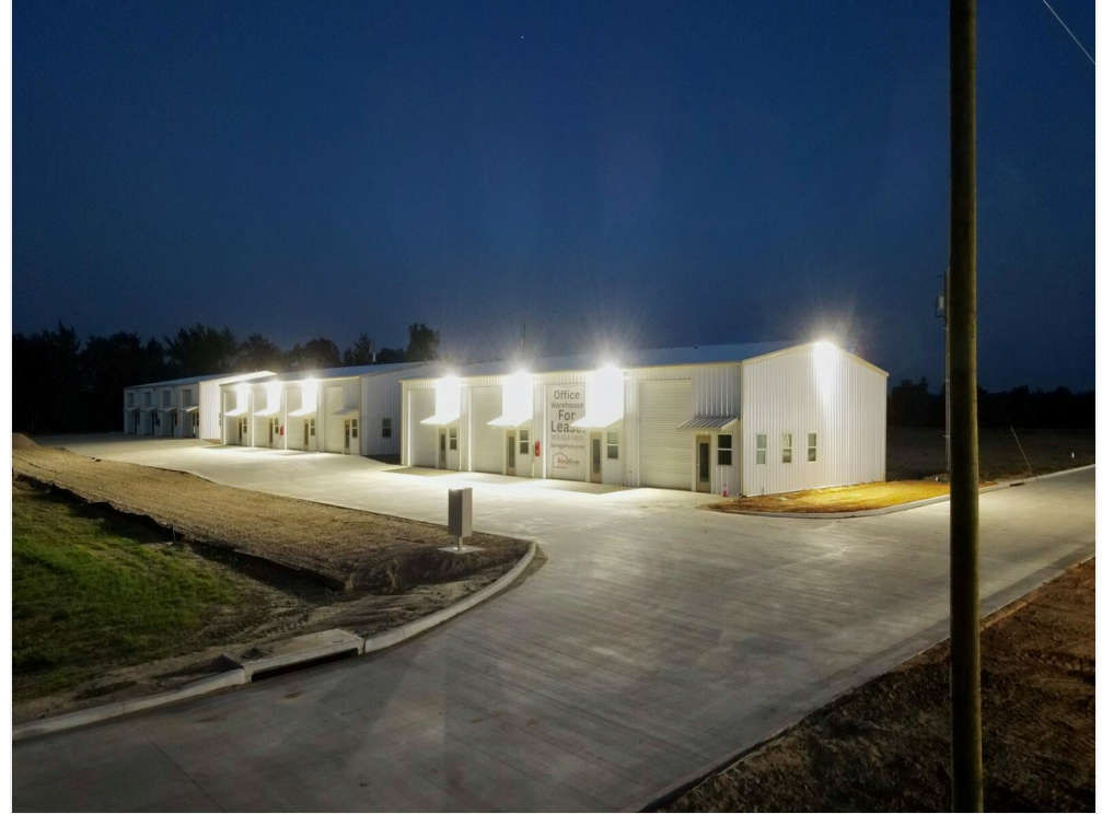
OW nighttime 2 buildings - 2