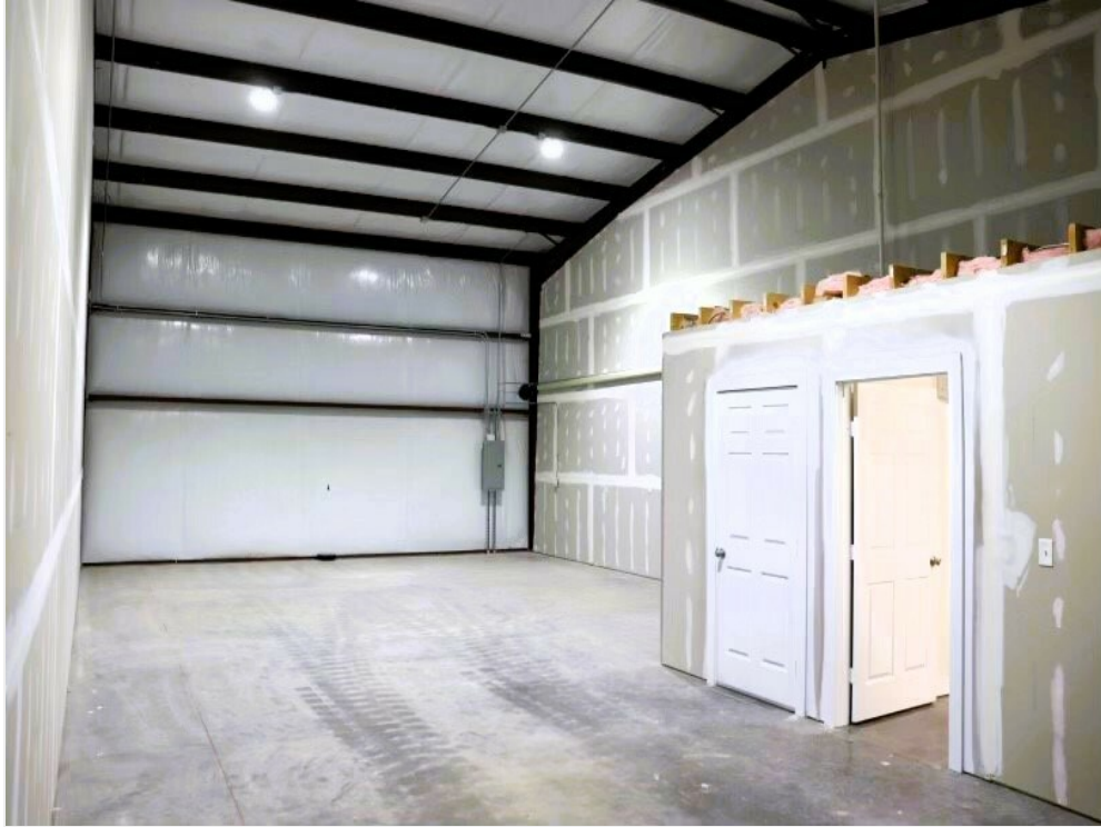
OW warehouse - 2