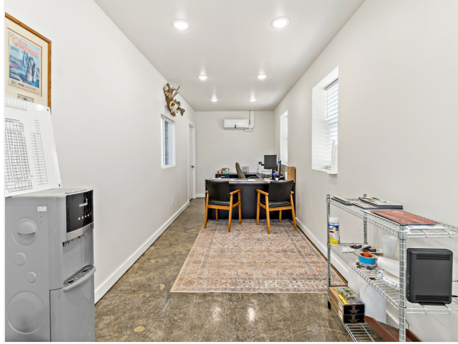
OW Inside large office