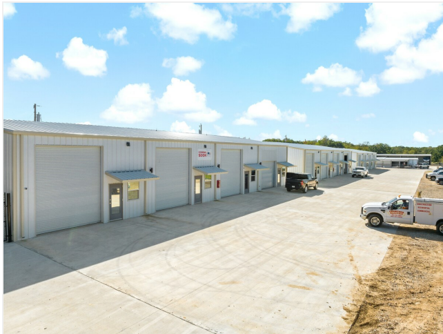
OW 3 Buildings from East