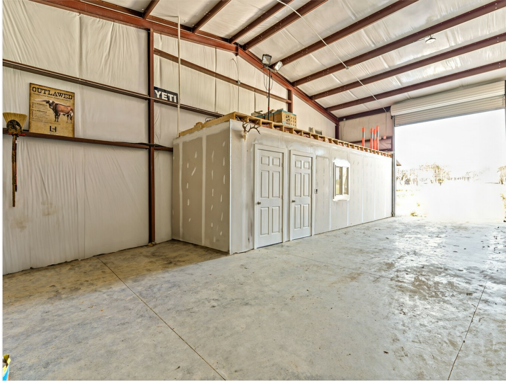
OW warehouse looking at office