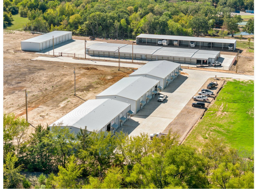
Drone of OW, CC and BT from East