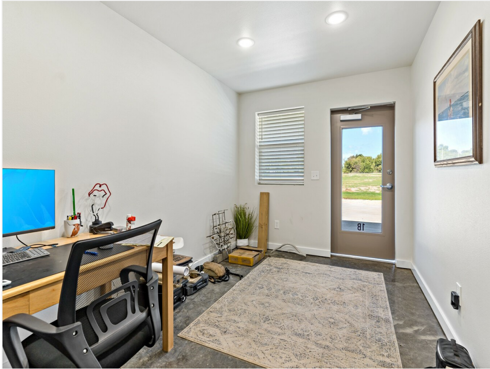
OW office small full