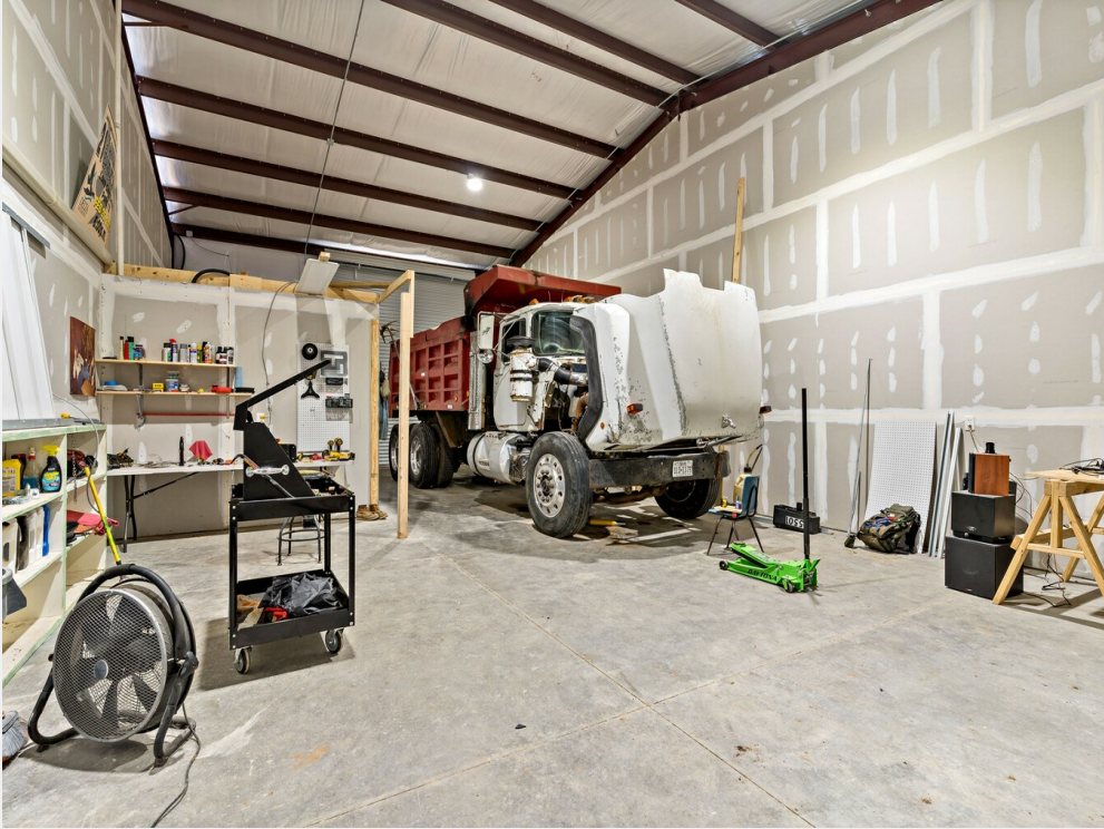
OW warehouse dumptruck