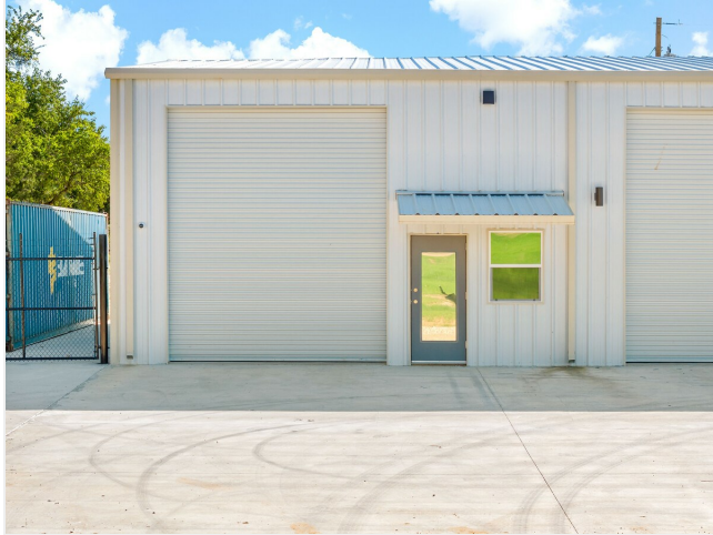
OW Exterior 1 Suite