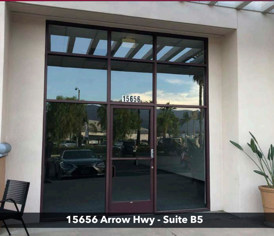
15656 Arrow Hwy - Suite B5