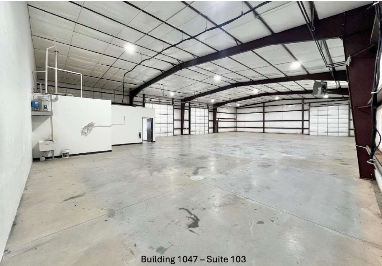
Building 1047 – Suite 103

Ryan Gilliland 405.249.7407 ryan@fleskeholding.com