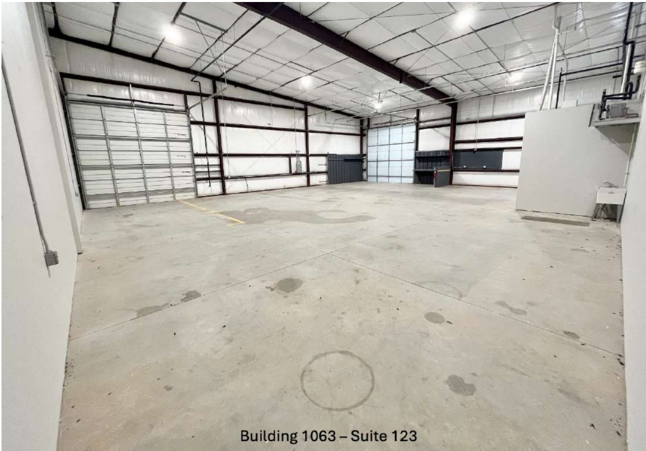
Building 1063 – Suite 123

Ryan Gilliland 405.249.7407 ryan@fleskeholding.com