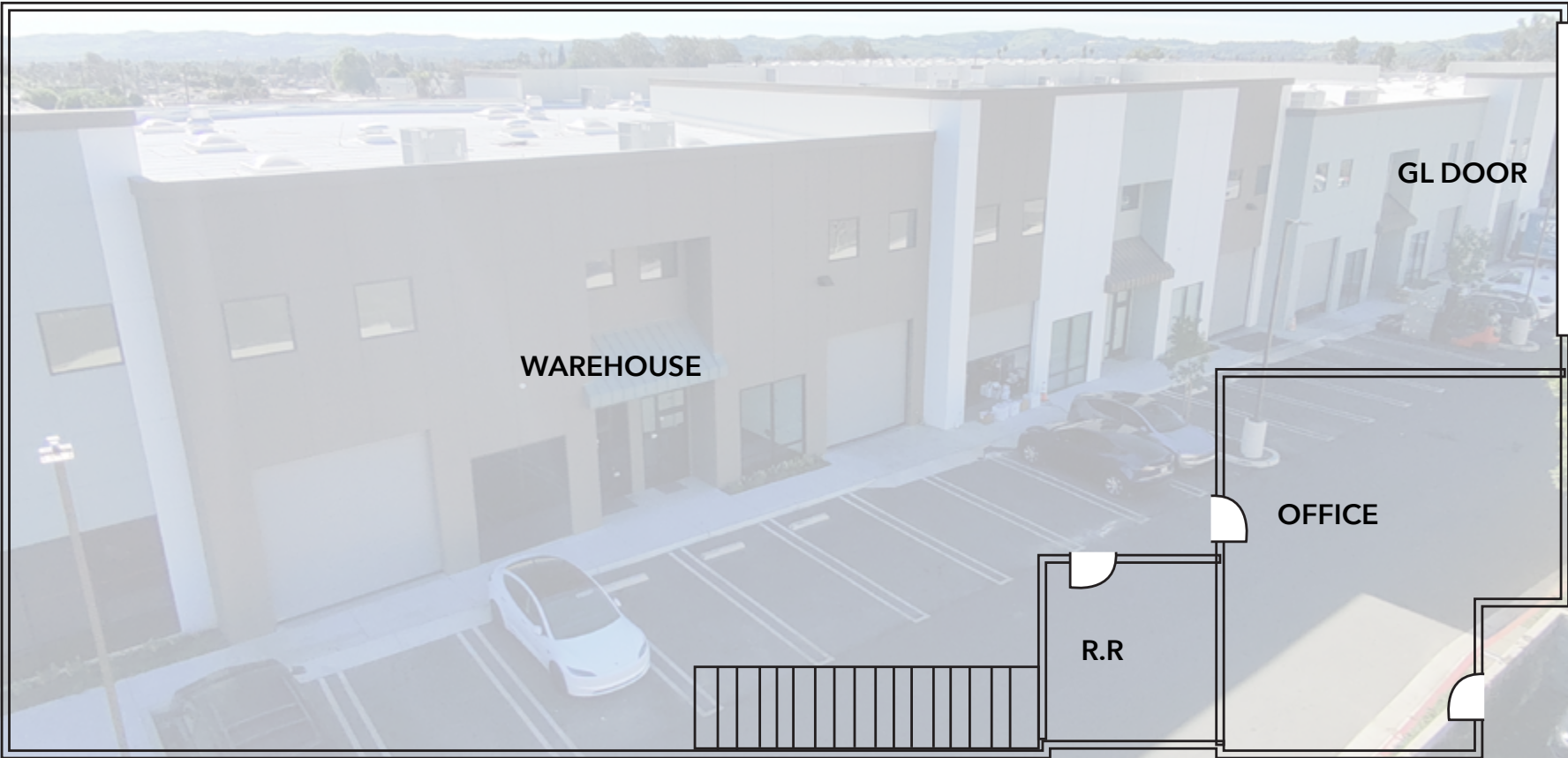
FLOOR PLAN (NOT DRAWN TO SCALE)