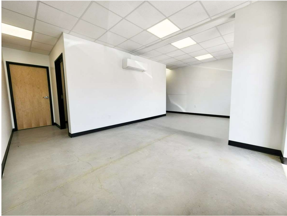
Office Space 2