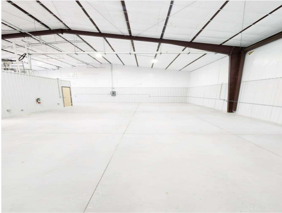
Warehouse interior side view 2