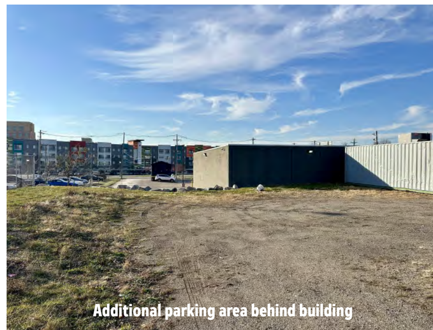
Additional parking area behind building