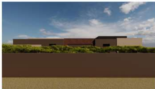
WEST PERSPECTIVE FROM RESIDENTIAL - 66' ABOVE FFE