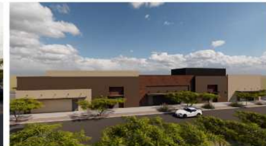
WEST PERSPECTIVE - 50' ABOVE FFE