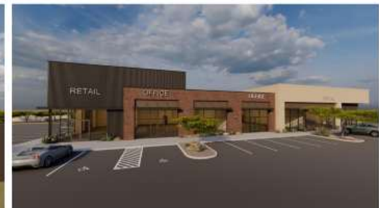
EAST PERSPECTIVE - APPROACH