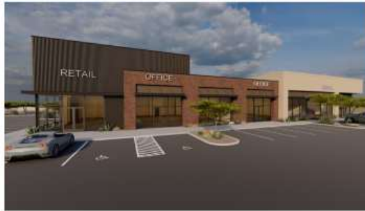
SOUTH EAST PERSPECTIVE