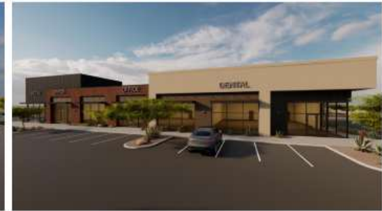
NORTH EAST PERSPECTIVE