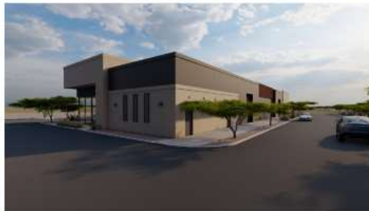
NORTH WEST PERSPECTIVE - 50' ABOVE FFE