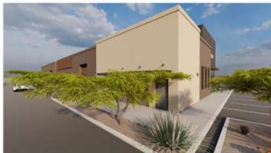
SOUTH WEST PERSPECTIVE