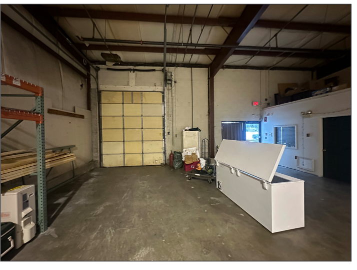
The information contained herein has been given to us by the owner of the property or other sources we deem reliable. We have no reason to doubt its accuracy, but we do not guarantee it. All information should be verified prior to purchase or lease.