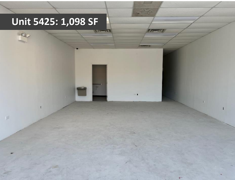
Unit 5425: 1,098 SF