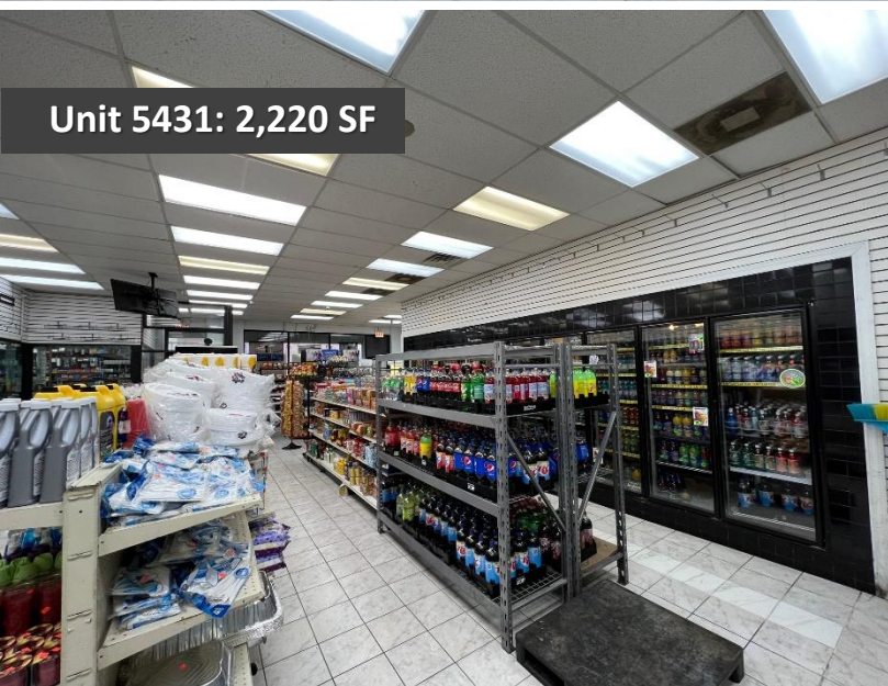
Unit 5431: 2,220 SF