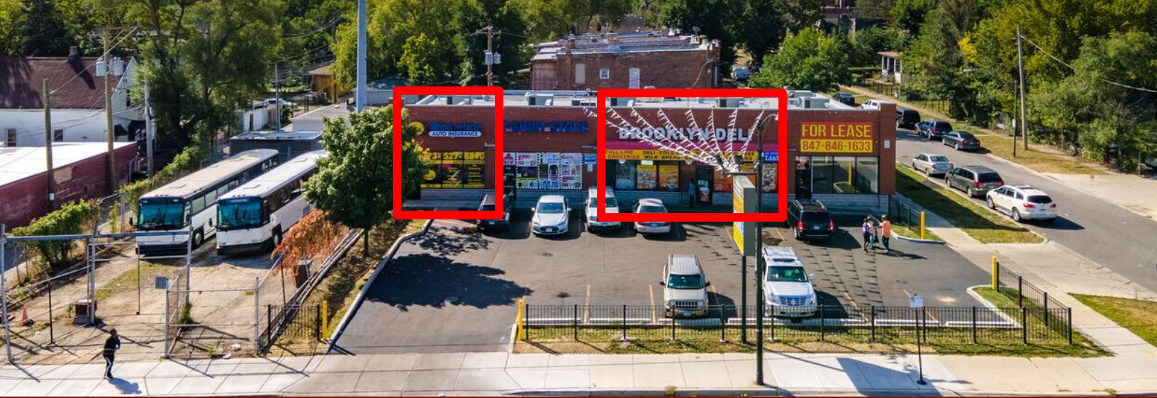
5425-33 W Chicago Ave., Chicago