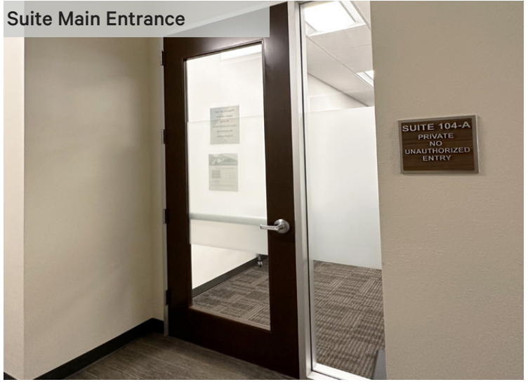
Suite Main Entrance