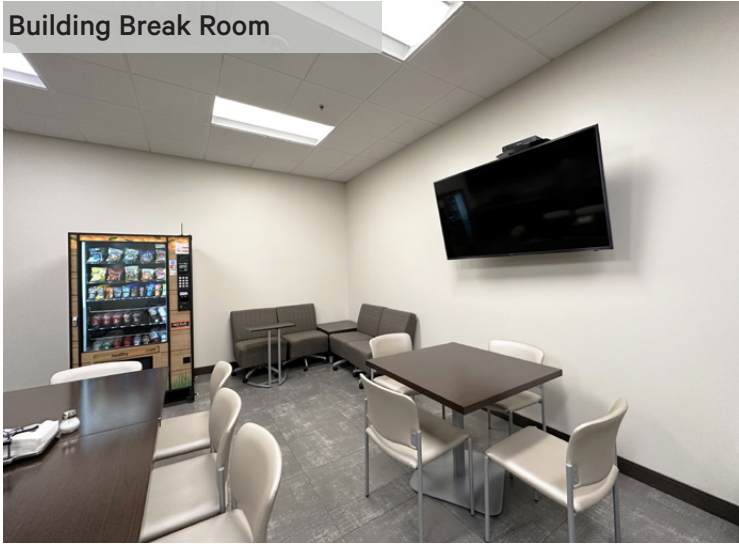
Building Break Room