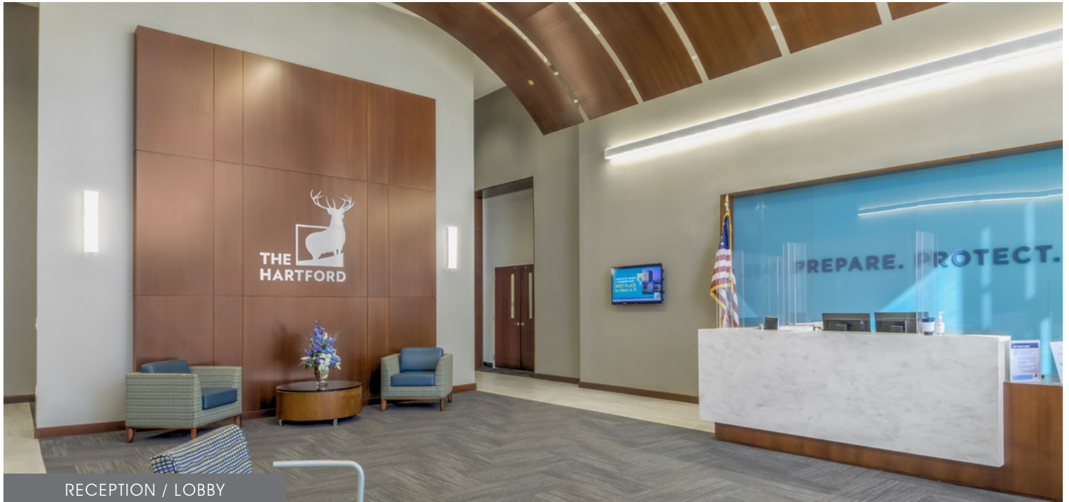
RECEPTION / LOBBY