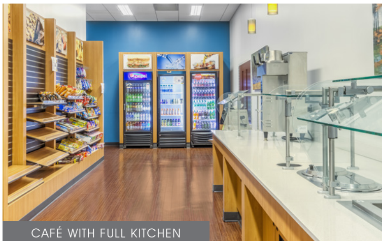
CAFÉ WITH FULL KITCHEN