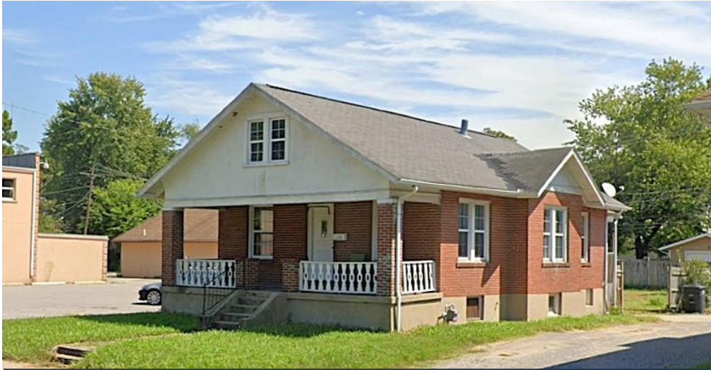
208 North West End Boulevard

Diverse Unit Mix, Strong Returns, and Prime Location in Southeast Missouri