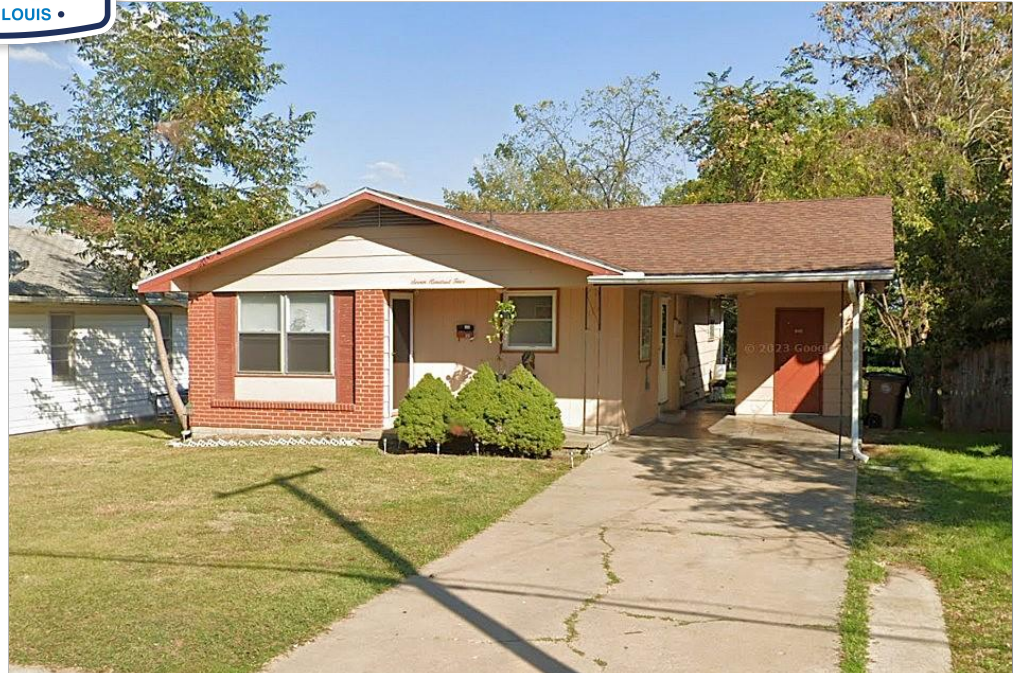
704 South Sprigg Street