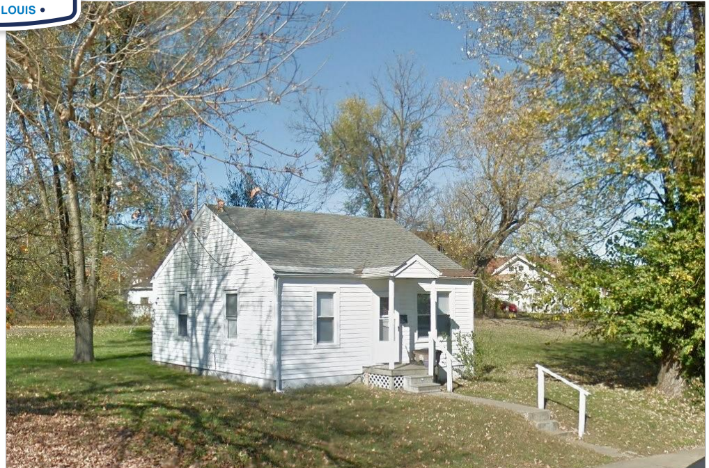
521 Asher Street