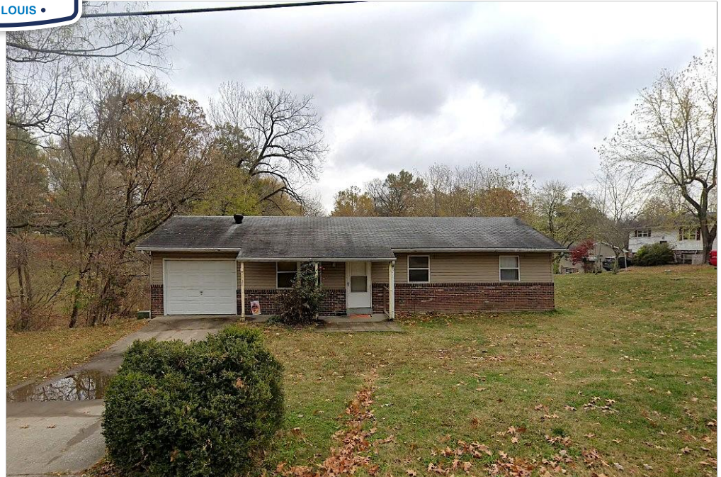
1726 Main Street