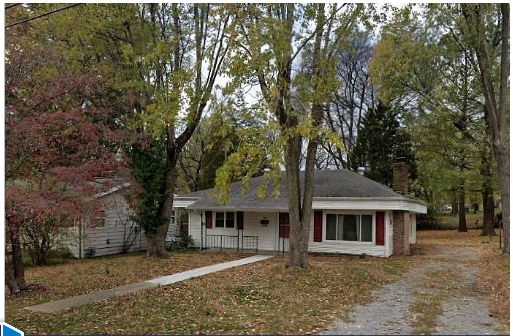
613 Albert Street