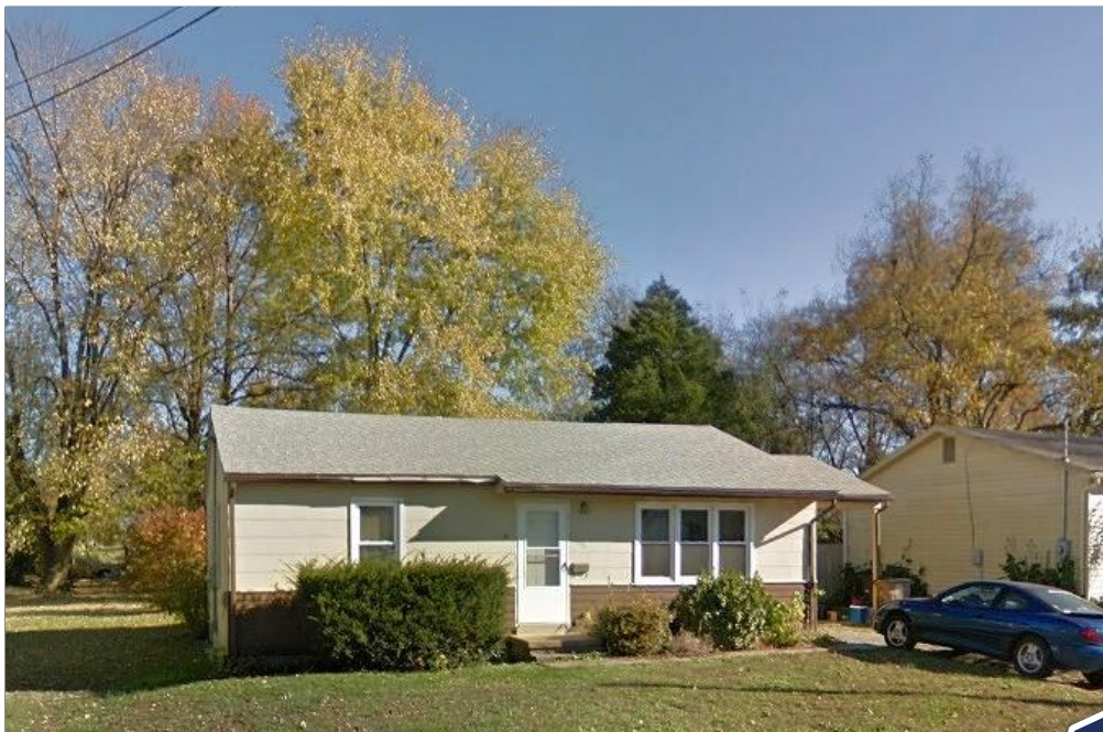
732 North Middle Street