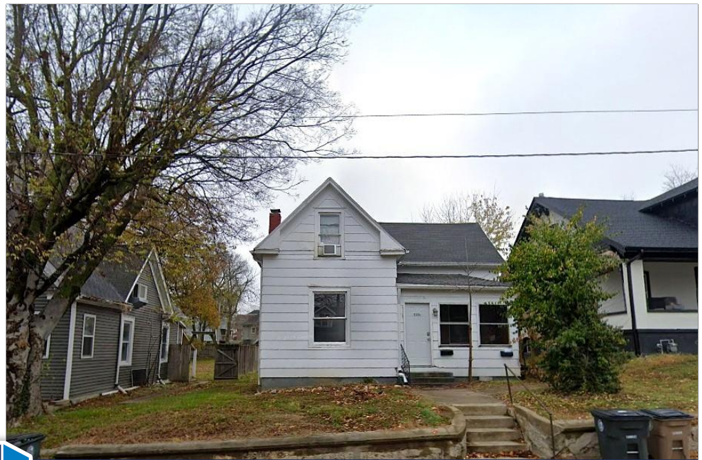
132 South Benton Street