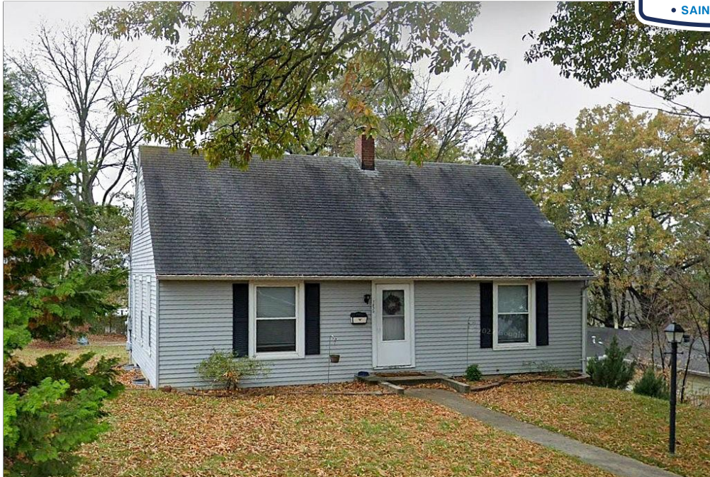
1629 Whitener Street