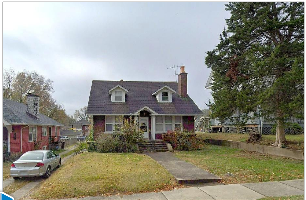
1441 Luce Street