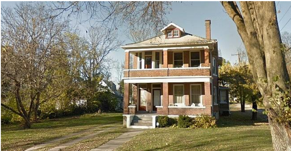
820 Merriwether Street