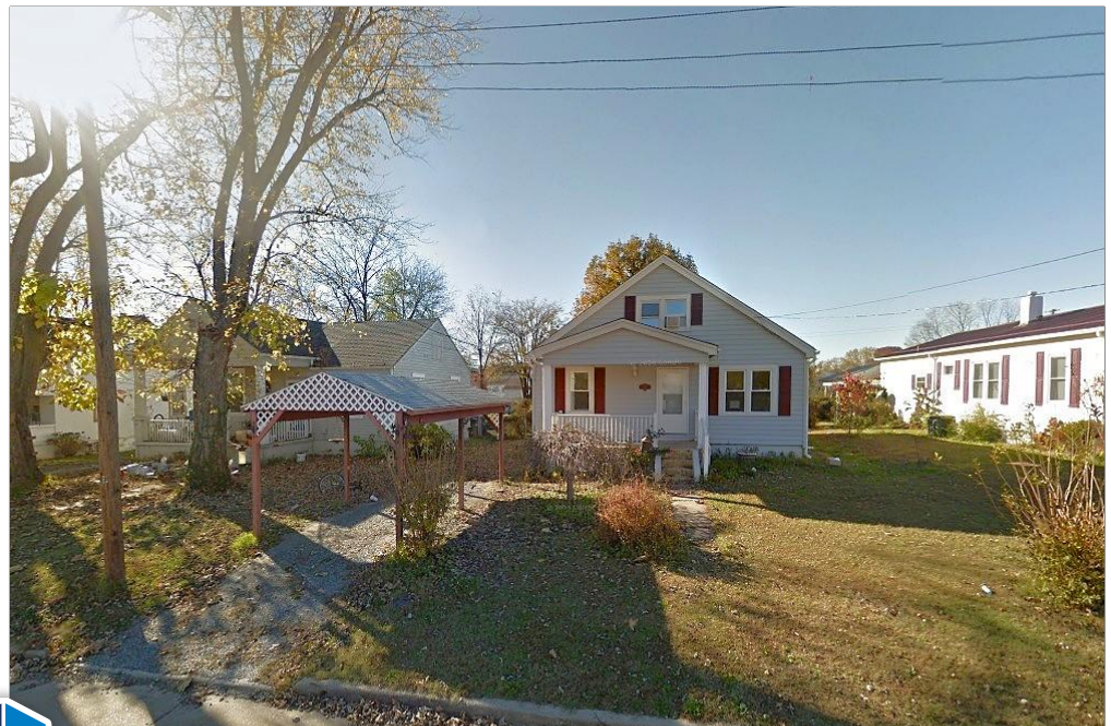
1113 North Fountain Street