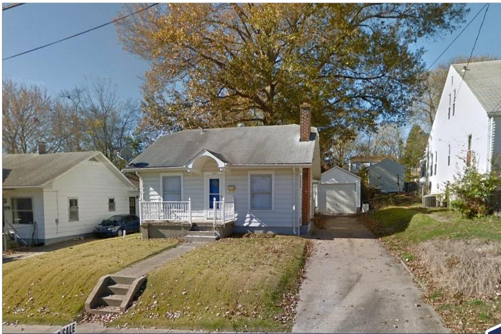
1437 North Water Street