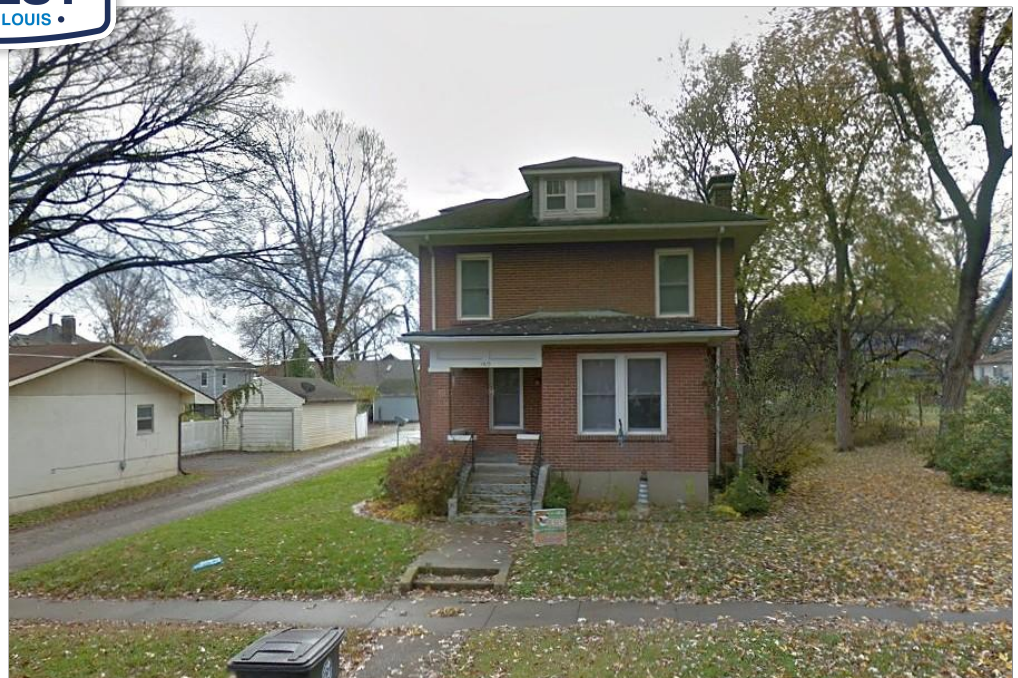
1415 Themis Street