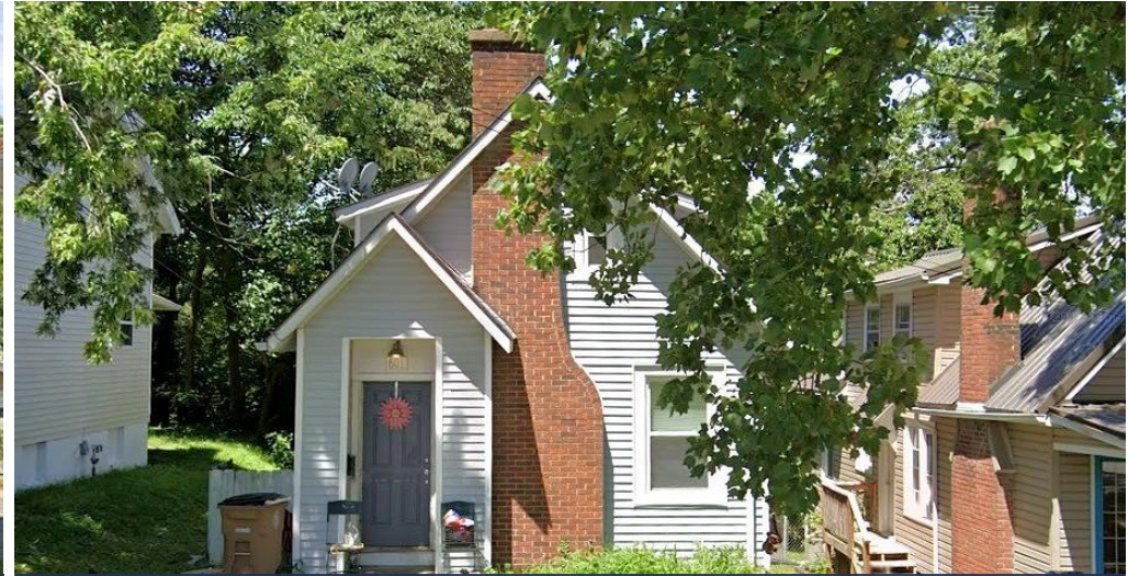
601 North Middle Street