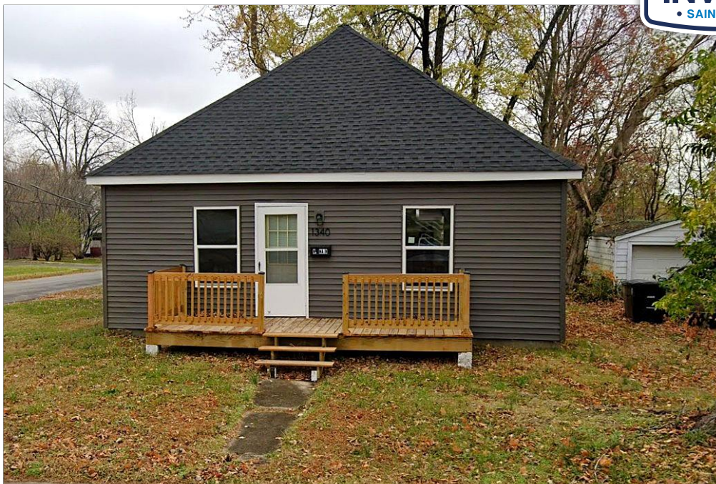
1340 Main Street