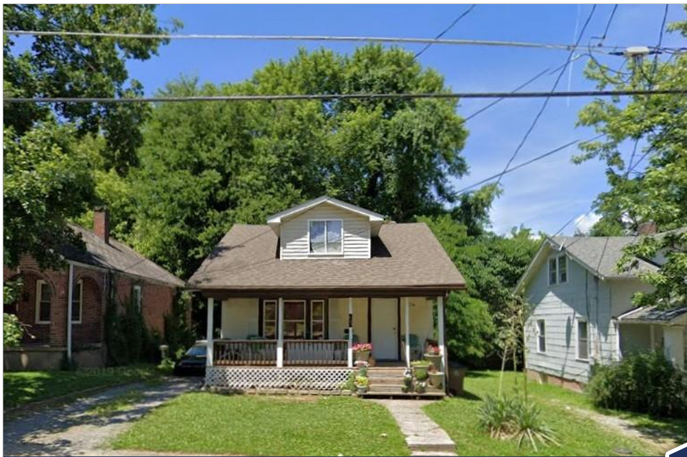
523 North Middle Street