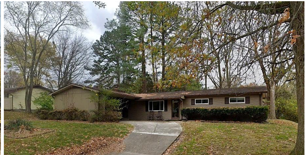
1715 Forest View Drive