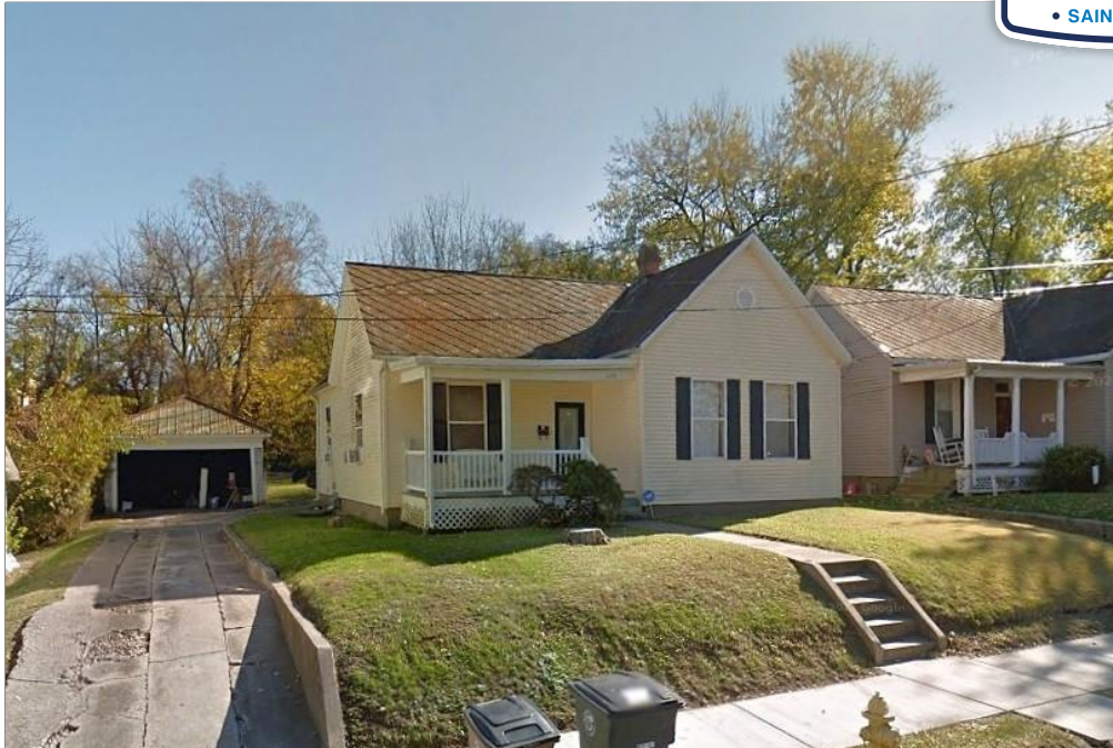
320 North Fountain Street