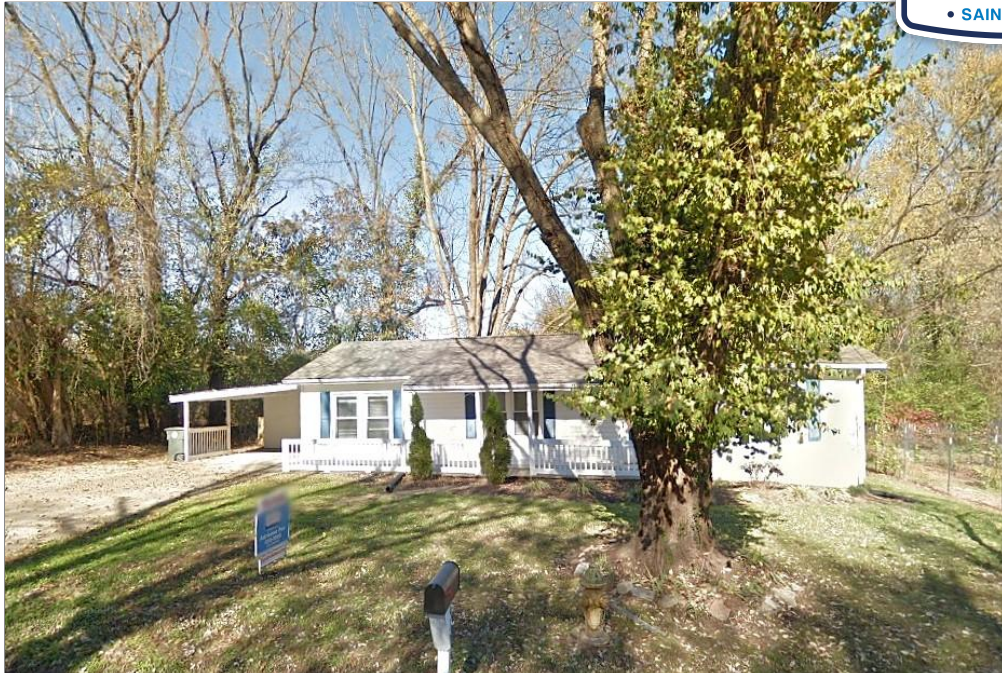
618 Ferguson Drive