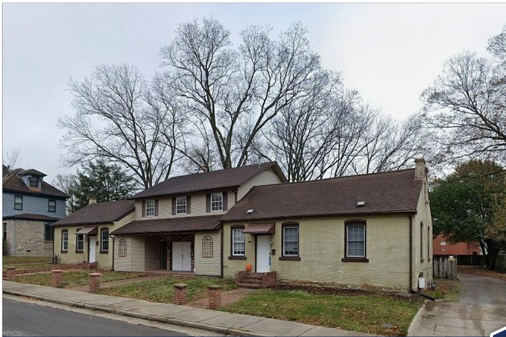
26, 28, & 30 North Pacific Street